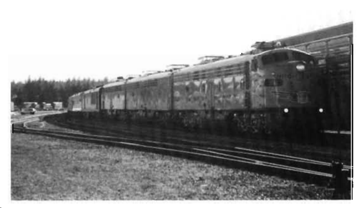
Top photo: The 805A is shown with the Circle the Wagons crew and the Nevada Museum's steam crew. Middle: A perfect threesome, our 921D, 805A and CSRM's 913 lined up in a perfect pose. Bottom: The Pacific Limited train rumbles into Portola with one of the Keddie turns during Circle the Wagon weekend.