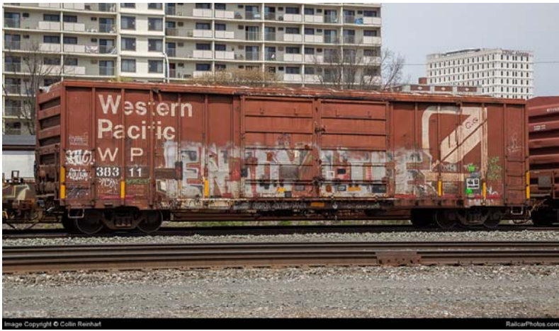
WP 38311 New Image boxcar