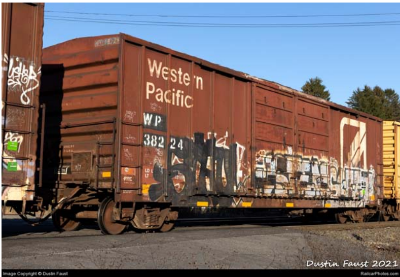
WP 38224 New Image boxcar