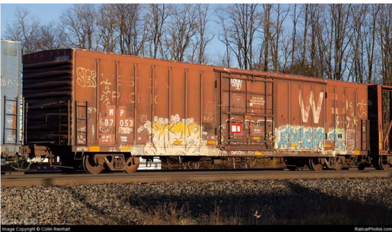
WP 67053 – Coors Beer insulated boxcar

Along with Greg's report about seeking to save some of the final WP freight cars, I have been tracking recent sightings. Here are some photos taken in the last 2 years of WP cars still in service: