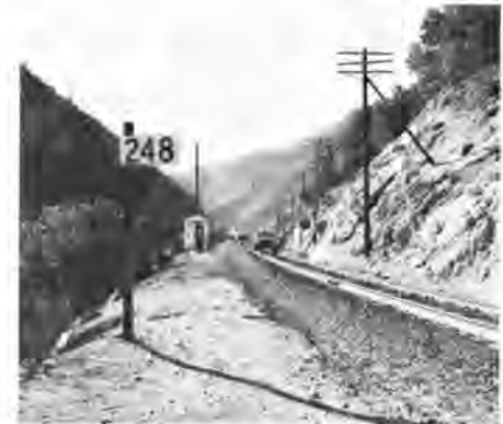
MILEPOST 248: Looking west, the absolute signal guards the east switch at Merlin.