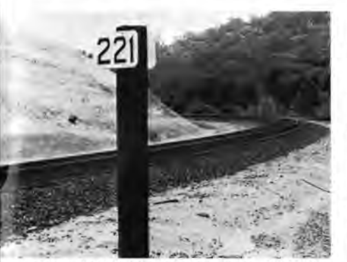
Milepost 221: A four degree curve, 2,158 feet long, one mile beyond Elsey station.