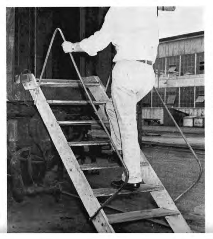
This man isn't about to fall, break bones, or hurt his back, because he's using a good support to climb onto a car. Do you?