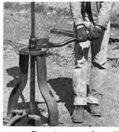
A good grip will prevent a slip, and a healthy back won't keep you awake nights.