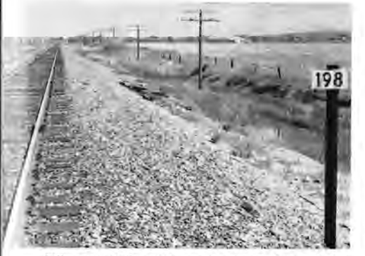
Milepost 198: Midway between Craig (125car capacity passing track) and Oroville Yard,