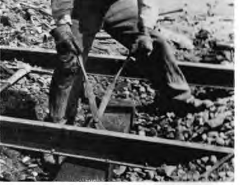
Proper tools and safety shoes prevent back and foot injuries.