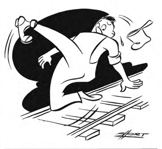
... YOU have all your toes, fingers, both eyes, and a strong back!