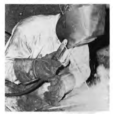
Burns can be painfulcover up to avoid them.