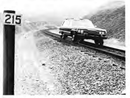
Milepost No. 215: Looking west past the Hy-Railer toward Oroville.