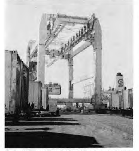
One of two sliding boom 45-ton cap. mobile cranes which run along 700'-long pier.

WP concurrently installed two 10car team tracks adjacent to Seatrain's facility to provide service for Seatrain and other Oakland Port area customers. In addition to carload service, WP jointly with Santa Fe, is moving Seatrain containers from Los Angeles to Oakland, the only West Coast port for their Hawaiian service.