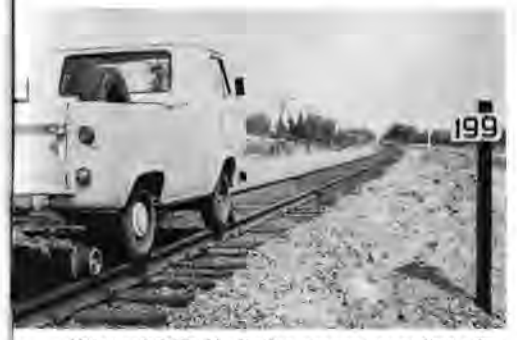
Milepost 199: Hy-Railer passes near Vista Robles, 35-car passing track.