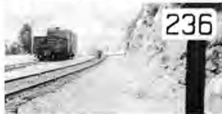
Milepost 236: shows 17 car siding at Jarbo.