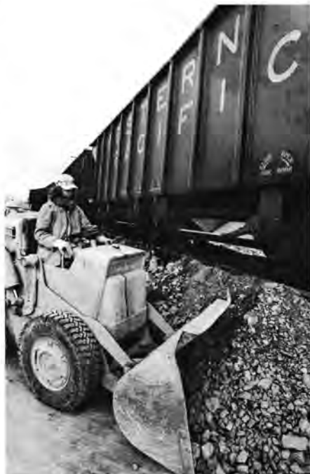
Crude Barytes ore is unloaded from new WP 100 ton open top hopper cars at Custom Milling Company yard in Salt Lake City, Utah. (below) Crude ore is placed on conveyor to be ground into a fine powder.

The Western Pacific serves a number of baryte mines in Northern Nevada. The unrefined bariun sulphate