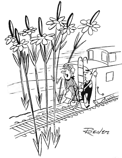
"Here's the spot where a car of high-potency fertilizer was coupled at more than 4 m.p.h."

"You always rave about traveling by California Zephyr. This time I did. I can truthfully say that this was the best trip I have ever taken by any train, plane, or car. This is saying a lot, as I've flown to Denver five times just since last July. My trip on the California Zephyr this time was pure pleasure—and what scenery! I'll come home by the same, and whenever time permits I'll be on this train.