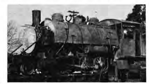
Above: A 50-ton industrial engine once owned by Sacramento Valley & Eastern Railroad.

Left: Built in 1913 this Prairie Baldwin was used by Southern Pacific as a switcher to shuttle military cargo between Rough and Ready and what is now Tracy Defense Depot.