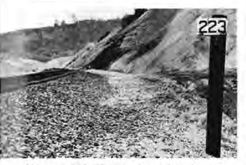
Milepost 223: Not far from Cherokee, once site of extensive hydraulic gold mining in 1870's, and where it has been reported that diamonds were first found in the U.S.