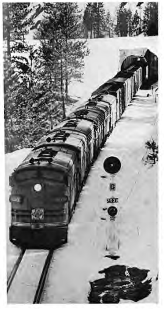
A 921-A with snow nose-plow comes out of Williams Loop leading 72 cars, most of which will run to Bieber as the Second #54 from the "High Line" junction at Keddie.