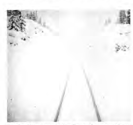
Tracks disappear during December snowstorm at Milepost 21, Keddie-Bieber line, as seen by Trainmaster Glen Metzdorf.