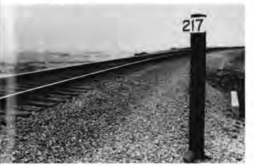
Milepost 217: Looking out across main line toward Chico in the far distance.