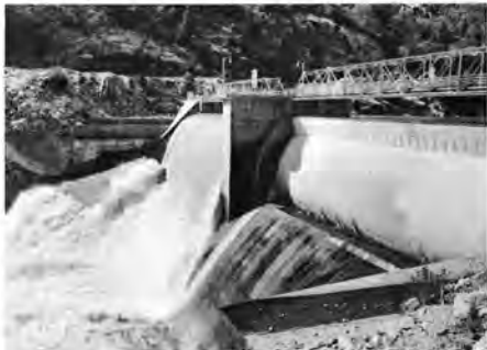
Cresta Dam, near WP mile-post #247, on the Feather River. The water captured behind Cresta Dam, which is 113 feet high and 384 feet long, flows through four miles of pressure tunnel which is 26 feet in diameter.