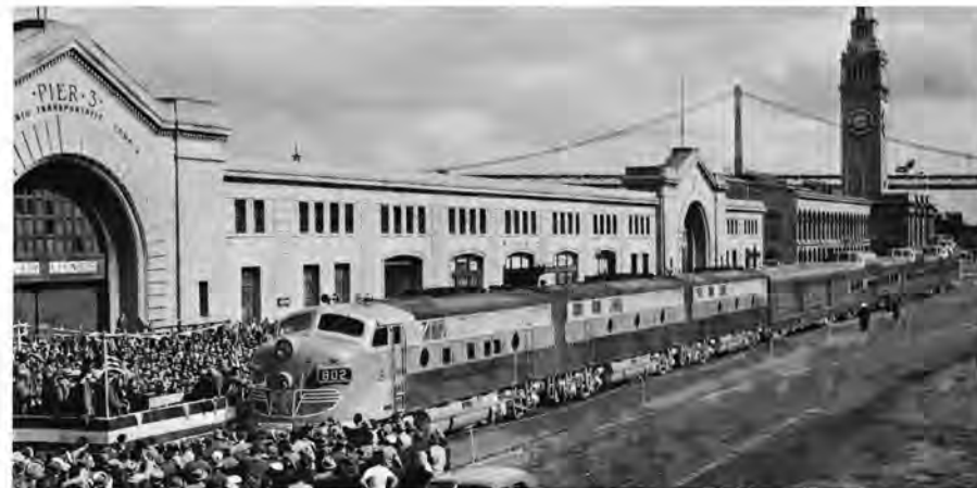
San Francisco, Ca., screen star Eleanor Parker christens the famed California Zephyr the day before it went into service on March 20, 1949.

To remind you old-timers and to entertain the newcomers, here's a peek into a time capsule of W.P.'s finest hours and momentous events, recorded by MILEPOSTS.