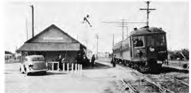
Sacramento Northern electric train (right) stops at Concord station just prior to last passenger run in June, 1941. 24 years later the first BART "test" car is delivered by the SN.

BART (Bay Area Rapid Transit) was in the news even way back in '64 and '65. June 1964 brought President Johnson to Contra Costa County for ground-breaking ceremonies, initiating construction of a 4½-mile test