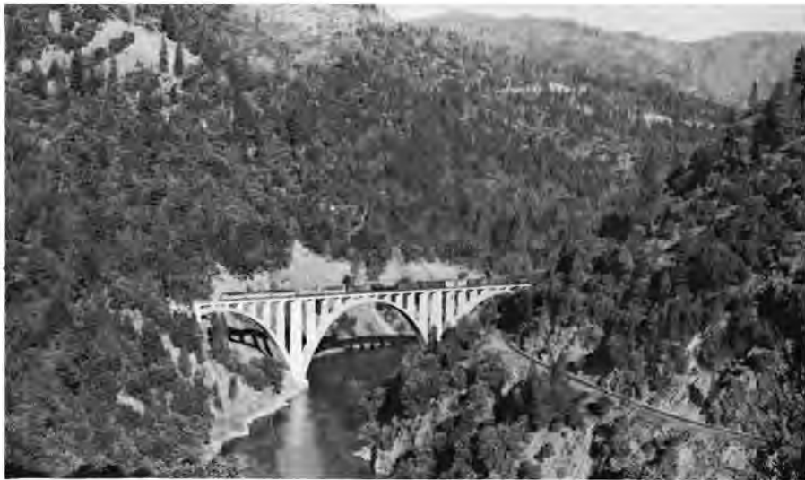
WP trains began operation over the 23 mile stretch of new main line on October 22, 1962. The North Fork Bridge over the Feather River

The permanent flooding of W.P.'s main line by the rising waters behind Oroville Dam necessitated mighty earthmoving and tunneling back in '62. A graceful concrete span over the North Fork of the Feather River and costs of about $40 million for relocation of the line were a major story then. Almost 13 years of work went into that project, made possible by the engineering talent of W.P.