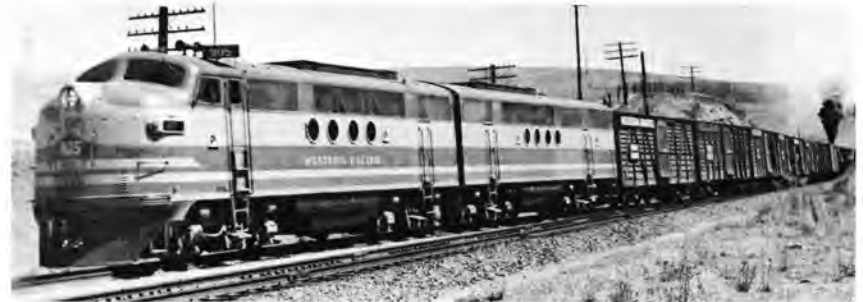
"Times—they were-a-changing. . . ." as shown with EMD diesel #905 (built 1943) at Altamont in 1949. Note steam helper about 12

Five years down the line MILEPOSTS was proud to announce new "power to the Pacific." Dieselization was rapidly replacing steam on the Eastern Division. The route along the Feather River was completely diesel that month, too.