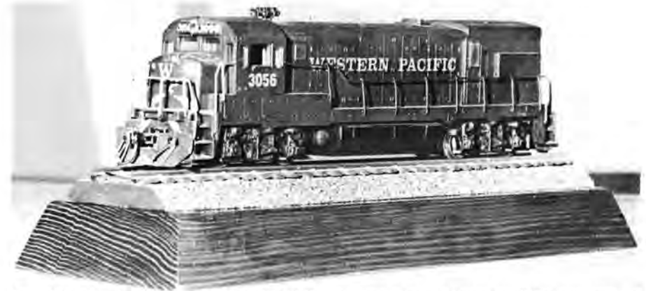
One of the popular (H.O. scale) models of WP locomotives is the GE-U30B. The handsome colors on the locomotive and cars is the exact