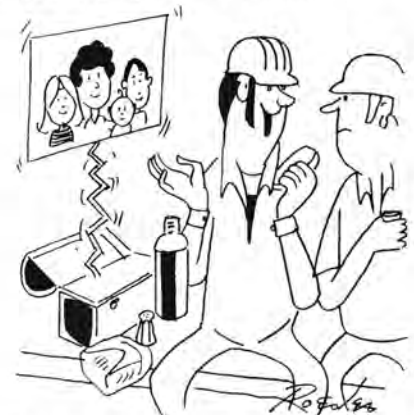
"IT'S A REMINDER----TO WORK SAFELY"