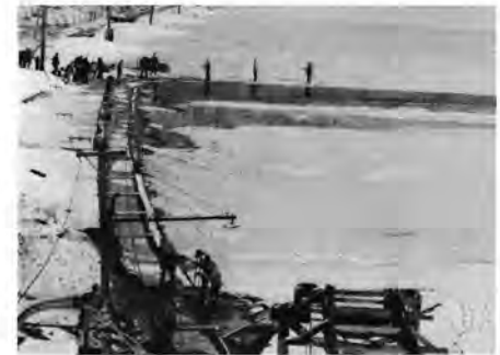
Overlooking the pond from atop the escalator as the ice moved up toward the ice house and through the edger.

Around November each year, Humboldt river water was pumped into an artificial pond and frozen 'naturally.' Saws "motorized" by Maude the reliable mule cut the ice into double-row blocks which were then floated down an open channel.