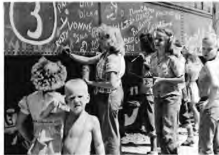
Part of the fun for kids at Winnemucca the day before was painting the sides of cars with names, faces and pictures. The result too, is a colorful train.

Kerak Shrine Temple of Reno picked up the nominal tab.