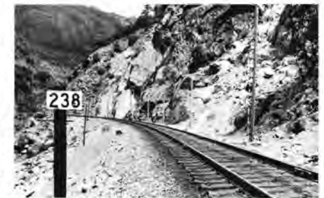
Milepost 238: located 1½ miles west of Pulga and 3/10 mile east of tunnel #12.