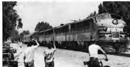
It took a 20-car special train to carry a record-breaking 1,127 Nevada youngsters to the Annual Shrine Circus at Reno in 1953.

Over 10,000 sleepy kids rolled home at the end of twelve years of "Circus days" knowing they'd been railroaded into a great time.