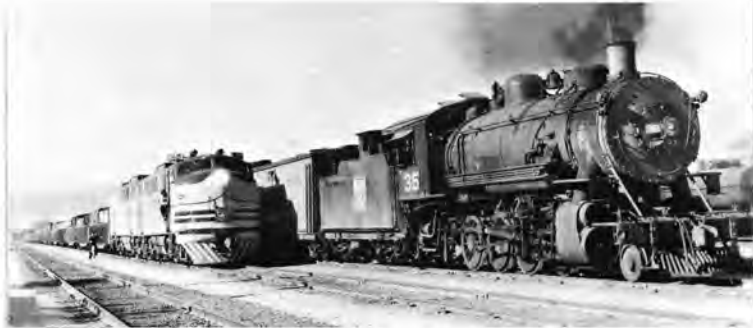
Oroville yard, 1950, steamer #35 (2-8-0) built 1909 and extra 902 built 1941 await orders west.

Steam was still dominant with only 59 diesel units out of 141 locomotives then on the line. But the times were a-changing fast.