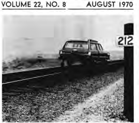
Milepost 212: Out of picture at the left is the power canal from Thermalito forebay.