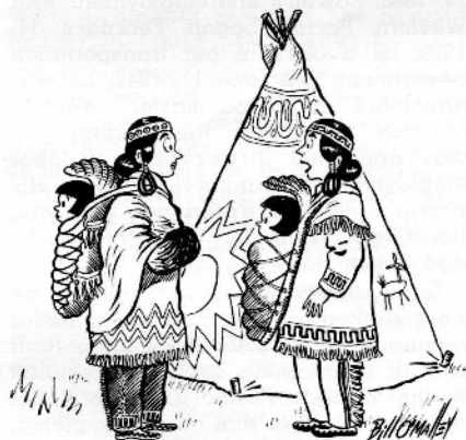
"SHE CAN'T STAND TO RIDE BACKWARDS."

Born at Gilroy, California, December 15, 1881, he entered WP service as a fireman on August 12, 1910, and was promoted to engineer October 21, 1918.