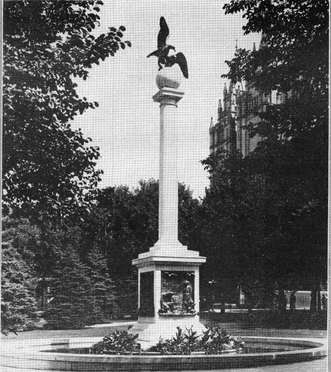
SEA GULL MONUMENT • SALT LAKE CITY, UTAH