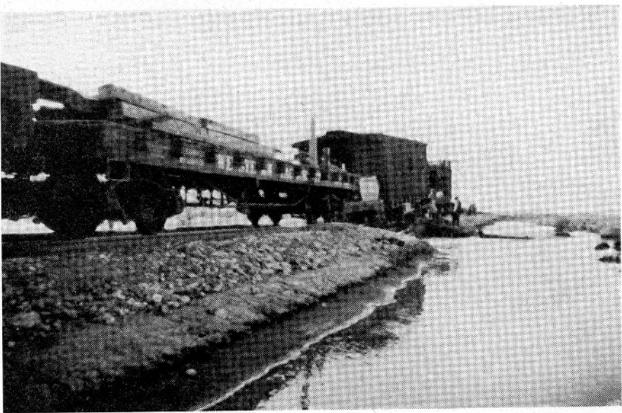
Washout Under Train Between Beowawe and Kampos-1910