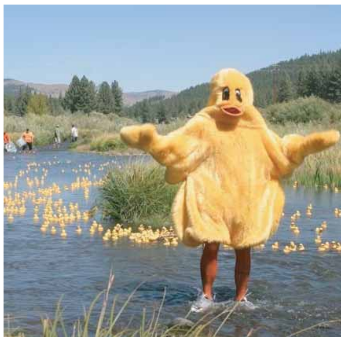
Rubber ducks fill the Feather River during the Portola Railroad Days "Lucky Duck Race"

If you have an opportunity to meet any of these hard working people, please be sure to thank them for their dedication to the organization and for giving of their time and sweat to make your Feather River Rail Society, and Western Pacific Railroad Museum, prosper.