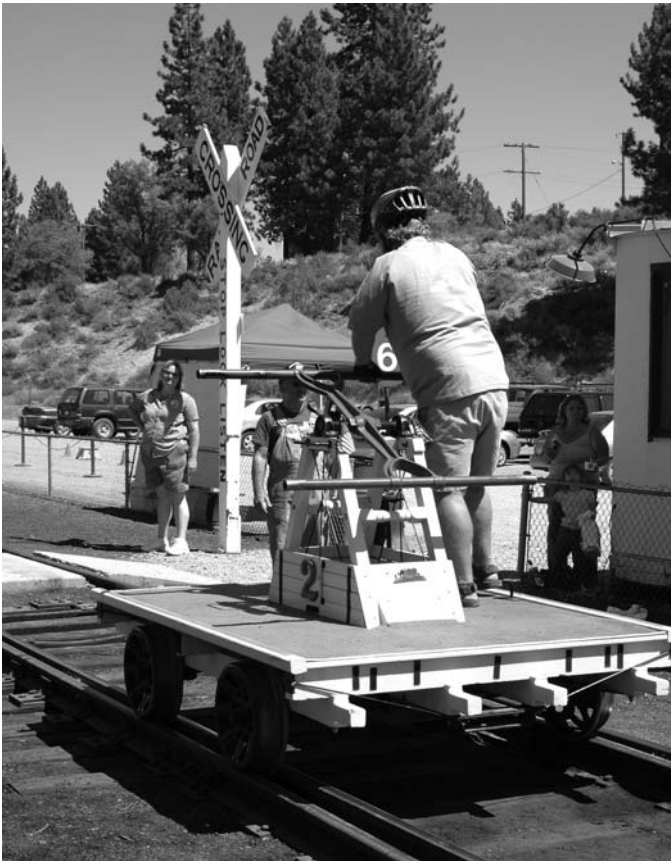
The handcar rides were a big hit with visitors.

On Sunday, the featured attractions included the traditional Willie Tate Memorial 5 and 10K run, fishing derby for kids, the traditional "Lucky Duck" races (with another record number of participants) and a freestyle motocross jumping show. A notorious group of gunfighters was also seen accosting people and having shootouts on the city streets, the museum parking lot and jumping the train and asking for donations (One of whom looked suspiciously like known desperado Tom Carter).