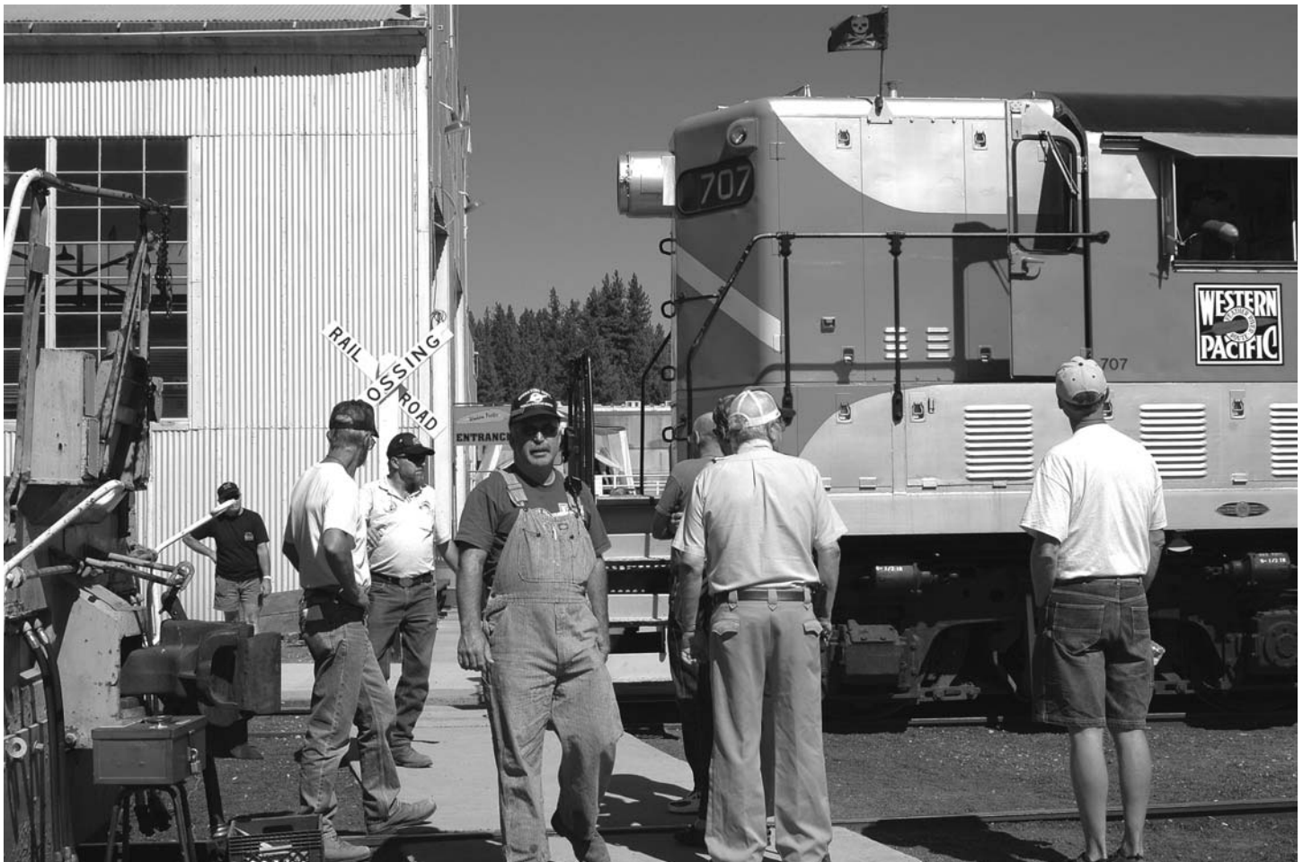
Visitors admire WP GP7 707 during Portola Railroad Days

This is our single biggest event of the year and the best opportunity we have of showcasing our collection, our work over the last year and get together and have some fun. Invite your friends and bring up a carload and join us for a great time!