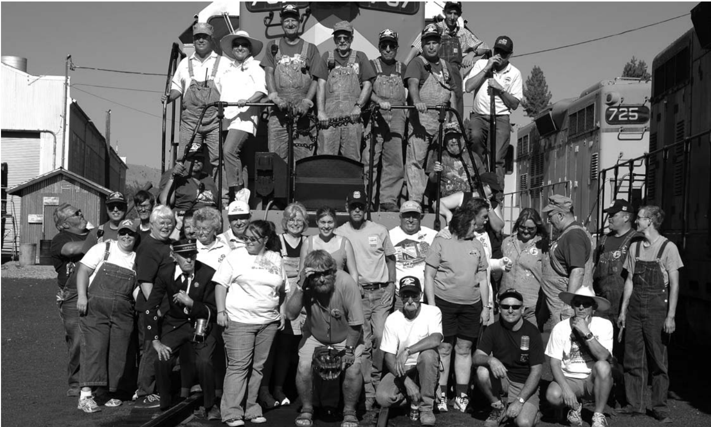
The Portola RR Days volunteers strike a pose for one big group photo