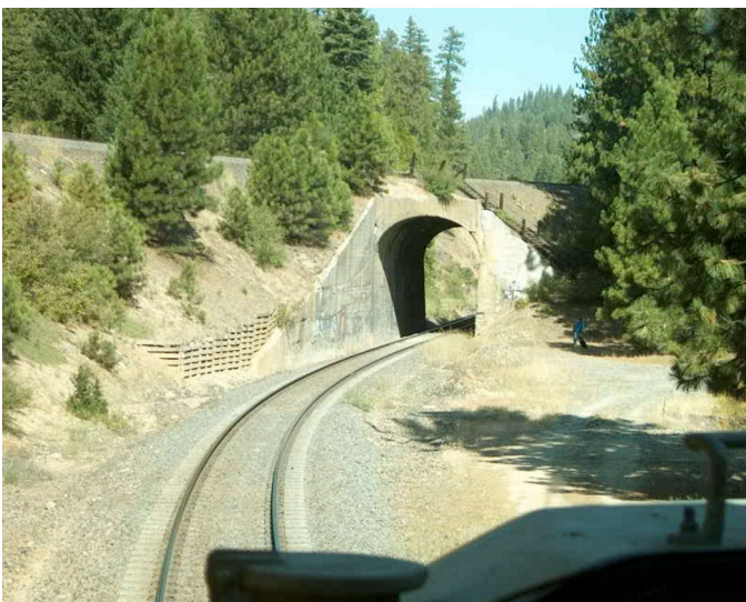
About to duck into the tunnel at Williams Loop.