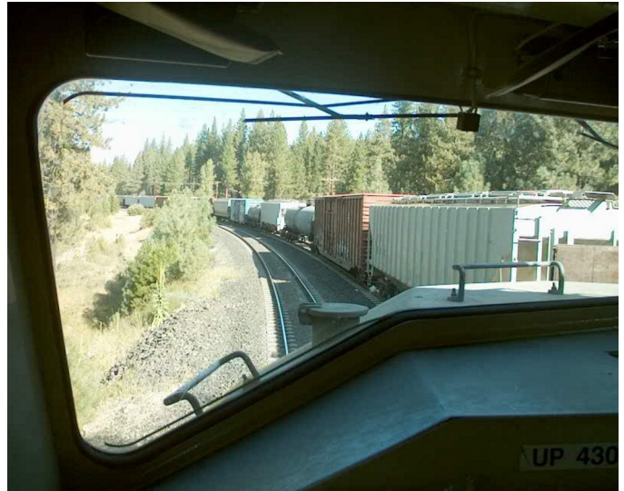
Meet with a UP manifest train (in the siding) at Blairsden, M.P. 311.