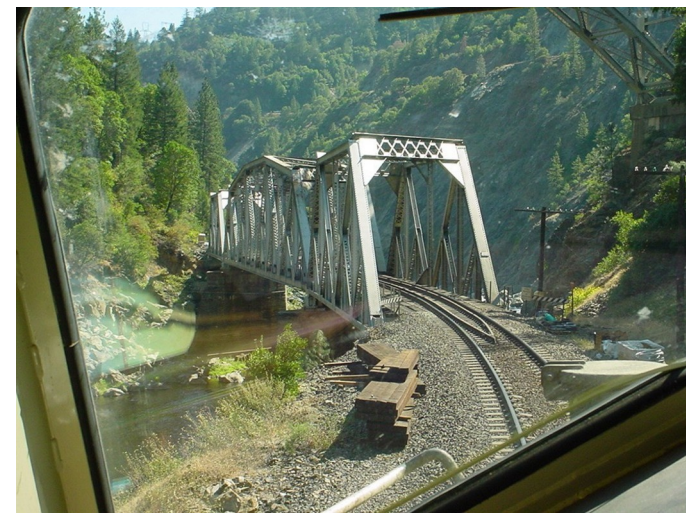
Three span through truss bridge west of Pulga.