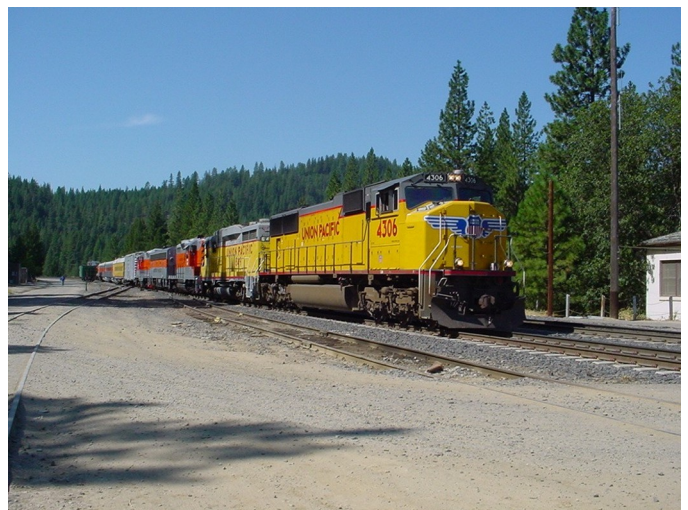
Waiting patiently at Keddie for a westbound stack train.