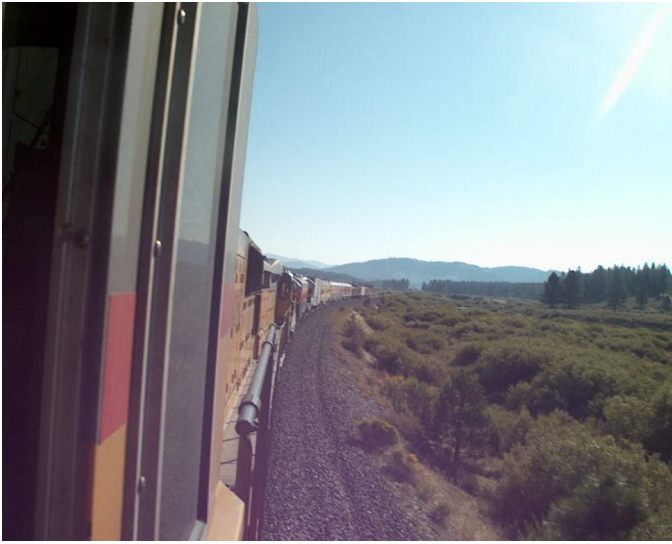
View of our train looking back from the head end.