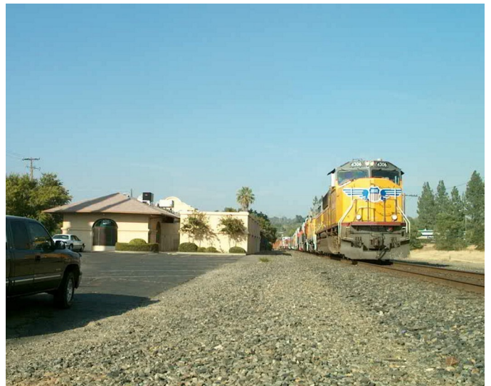
UP 4306 West stopped at Oroville depot (M.P. 205)