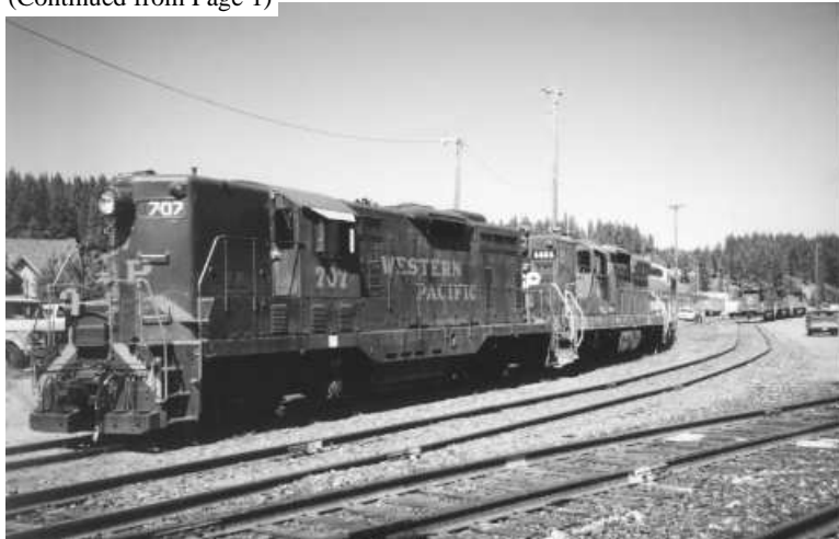
Shortly after arrival in Truckee the train was spotted in the clear while the crew took a break prior to spotting the equipment.