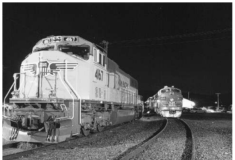
Generations apart, both old and new EMD products shared the spotlight at Truckee.

Off again, the train rolled on until we stopped in Boca,