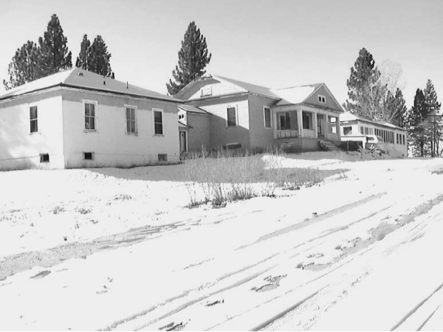
A cold December morning shows the hospital as it looks today. With work, grants, and effort it will be rebuilt.

Serving the community, Western Pacific's hospital in Portola was first established in 1914. Building and grounds were owned by the Western Pacific and leased to the Medical Department. An addition was added a few years later and in 1950 the building was rehabilitated at a cost of $25,000.00. A grant of $11,300.00 from the Ford Foundation was awarded on December 13, 1955 with the first half of the grant arriving in July 1956 and the second half within a period of the following 18 months. No part of the grant could be