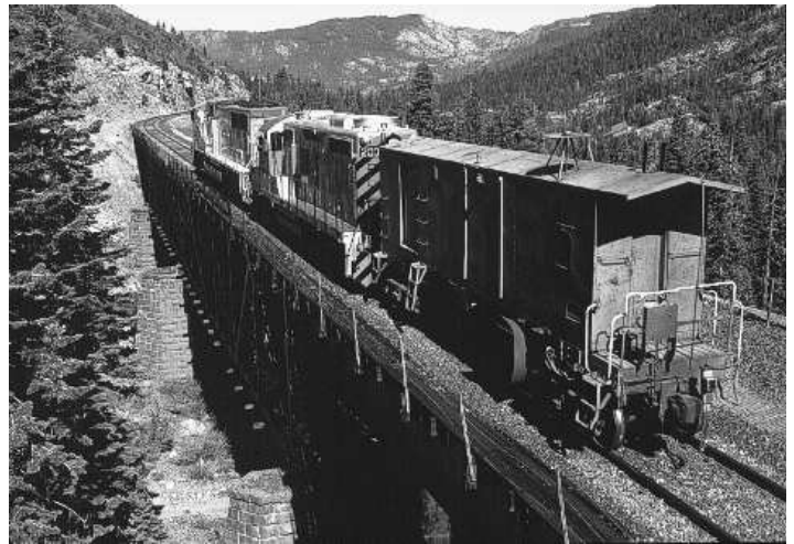
This view will probably never be repeated. Near Shed 10 UP 4167 West pulls our WP GP20 2001 and an ex-SP flanger towards Roseville on Sept. 11, 2000.

To preserve and interpret the history of the WP, the "Willing People" as a vital link in the development of the rail industry on the West Coast, including the steam and diesel evolution, WP's influence in the passenger tourism industry, the impact of freight competition between neighboring railroads. WP's influence in the lumber, mining and agriculture industry from Plumas County throughout California, Nevada and Utah