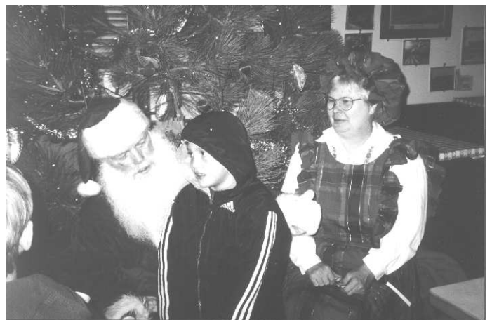
Santa and Mrs. Claus heard many requests during the evening.