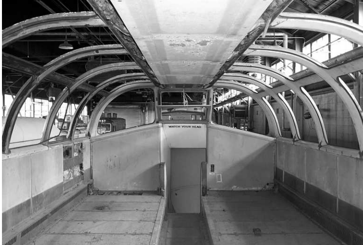
Cleaned and awaiting restoration the dome section will be one of the major attractions of the Hostel when complete.

The producers may be back to check on our progress with the Hostel and the 805A as their work compiling the documentary continues. No word on when and where it may air, but we will keep everyone posted.