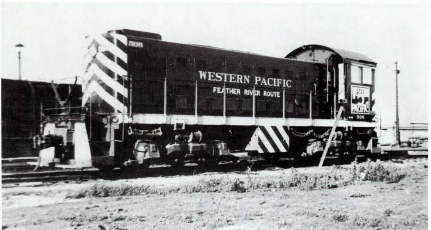
WP Alco S-1 No. 506 in Oakland, April 16th, 1944

Also: Railroad Days in '88 Operating Department News Feather River Short Line News