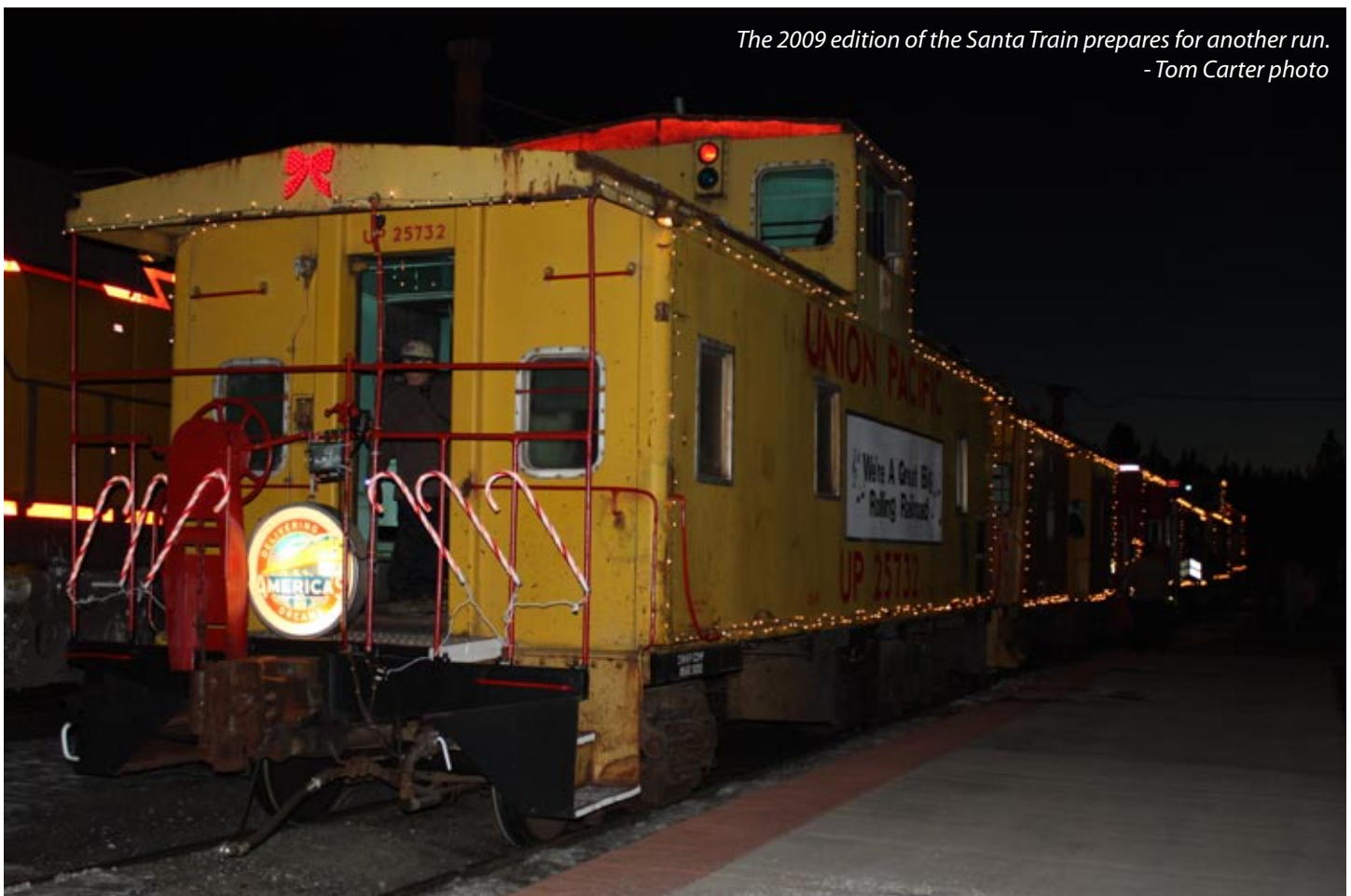
The 2009 edition of the Santa Train prepares for another run.

The Second week was a lot more of a challenge: between the two Saturdays, Mother Nature unloaded a series of snowstorms that had us all