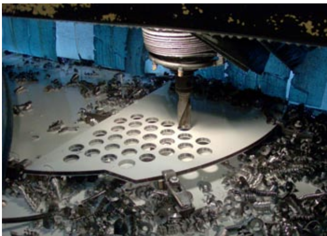
The new tubesheet section on the mill at Redman Equipment and Manufacturing.

This part of the pressure vessel was replaced due to the deteriorated condition of the existing piece, having been over-rolled, cracked and welded through the bridges repeatedly over the years. We could have used the original front tubesheet as is, but the amount of work it would have taken to keep it serviceable would be frustrating and tedious.