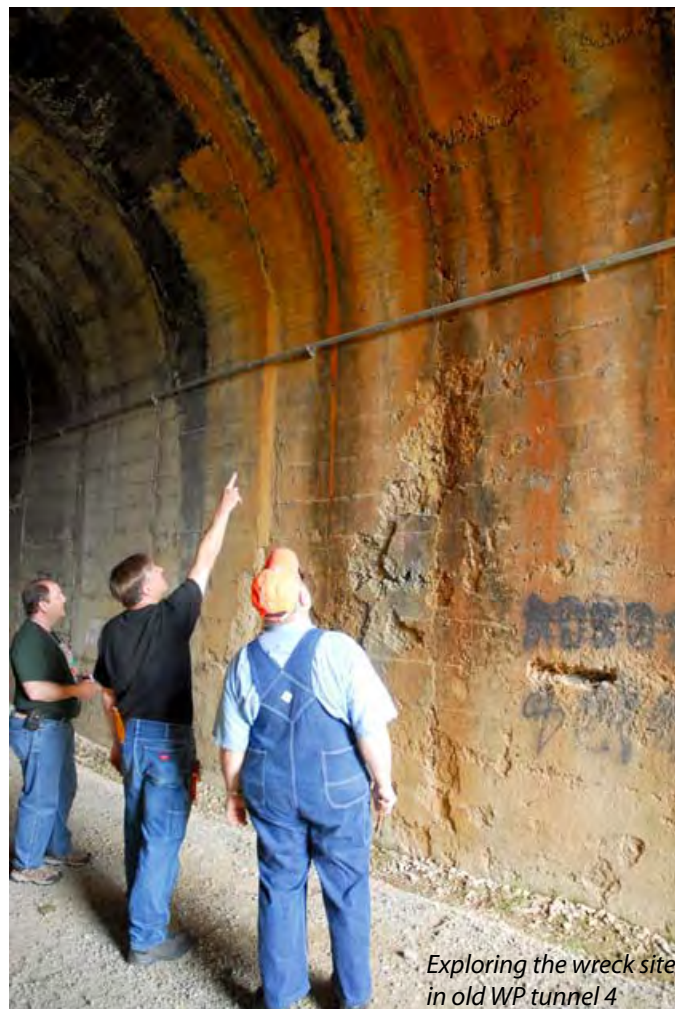
Exploring the wreck site in old WP tunnel 4

The raffle table was well supplied this year with a number of outstanding donations. Among the sponsors of this year's raffle were Athearn Trains, Cannon & Company, Microscale Industries, Kadee Quality Products, ExactRail, InterMountain Railway Company, The Western Depot, Tom's Trackside Trains, Micro-Trains Line, Wm. K.