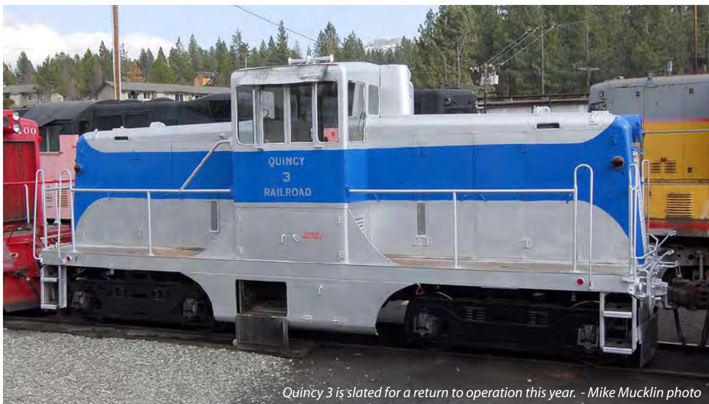
Quincy 3 is slated for a return to operation this year.

Each locomotive also now has a running file of all the work performed on it, parts used, and the mechanic performing said work. Any person performing maintenance or other work on a locomotive is asked to fill out a Mechanical Department Volunteer Log and to drop it off in the CMO box. I will update the running file myself from the volunteer logs. We are also in the process of organizing our large number of locomotive parts as well, including new storage, segregation and inventory tracking.