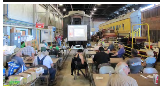
2021 Members' Meeting

To subscribe to the WPRM News email list use the subscribe tool on the "About Us" drop-down list on the society website. Each email will have an unsubscribe link in it if you change your mind later.