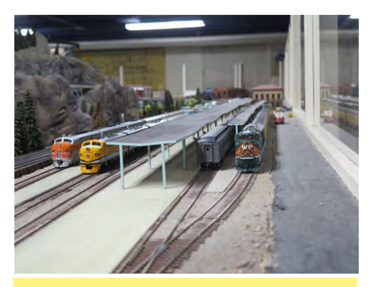
Welcome to the Station