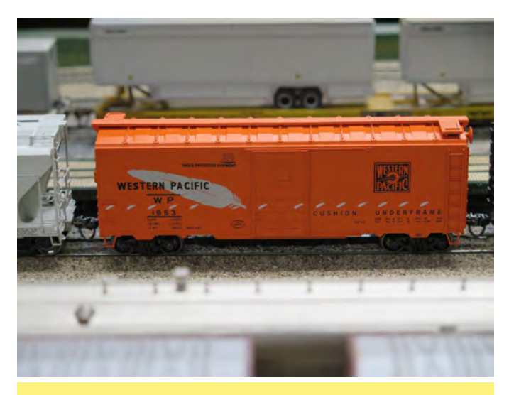
WP 1952 Box Car