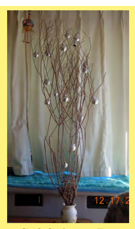
CMO Christmas Tree

Three Crew Training classes are scheduled for 2017. They are scheduled for April 8th, 9th and April 29th starting at 10 am at the museum in Portola. You need only attend one day of training. Please use the "join our Operating Department" link on the museum's home web page to register for the class day of your choice.