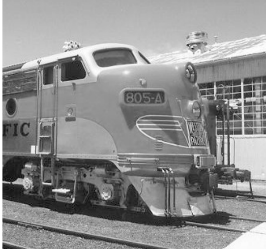
The 805A as it appears today in Portola.