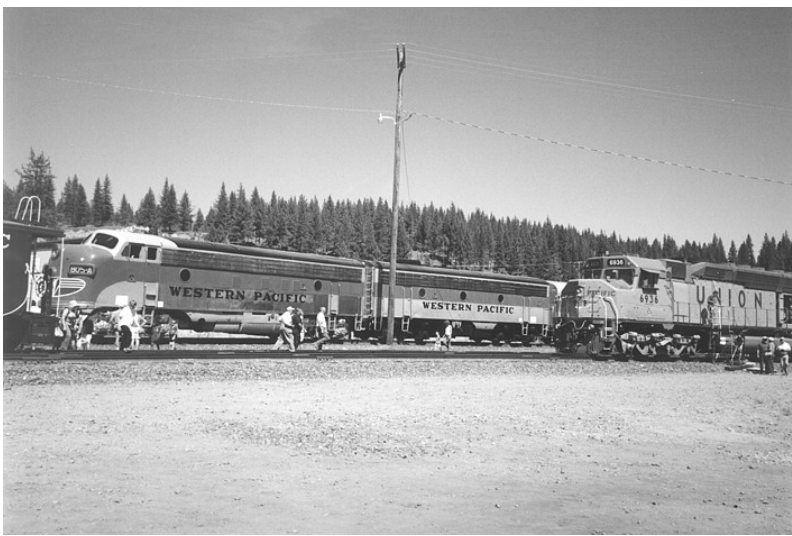
Visitation of the equipment thinned somewhat during lunch but quickly picked up shortly after on both days. - Dave Bergman

allowed to "walk" past the derailment and continue non-stop for Roseville arriving and securing the train with our watches showing 5 am. After some much needed sleep, we departed Roseville for Portola at 1 pm on Monday September 10. We ran non-stop to Oroville but before arrival, I was instructed to call the Dispatcher on the phone ASAP. At this time we were notified that another derailment had occurred ahead of us in the Feather River Canyon at Belden and they were unsure of when the track would be opened so they were going to take us up to James and call a relief crew. At this point, I talked with Steve and decided the best thing for the equipment was to park at Oroville for the night and try again in the morning. Once Omaha realized that we were a "free" crew, they agreed to our request and once again we tied the equipment down for the night. Steve and I, along with Vic Neves and John Walker, made a couple of trips down to the yard that night to make sure our train was safe and the "free riders" had not made