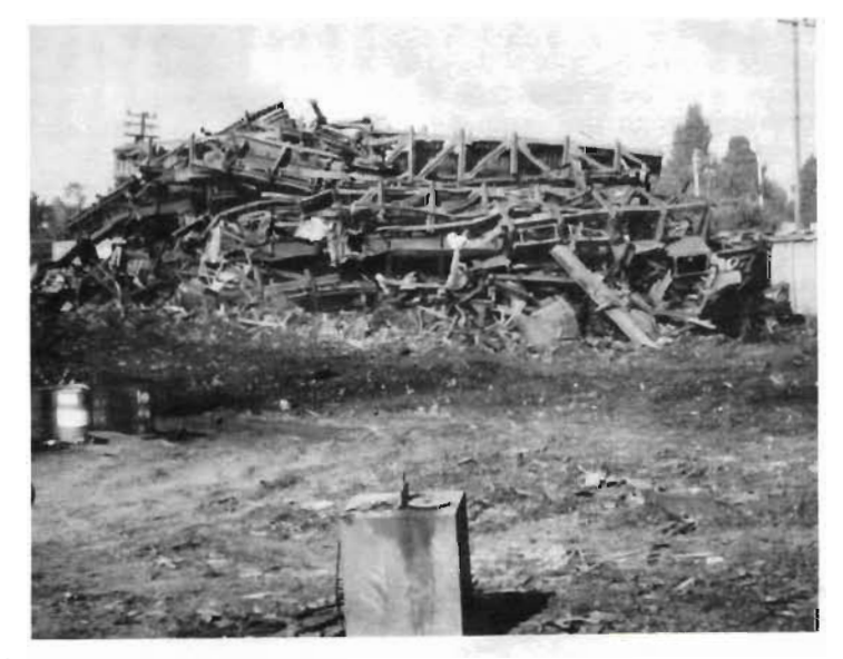
Our three former Southern Pacific sugar beet gons arrived in Portola on December 29, 1993 and were set into the museum along with the O&NW equipment on January 3, 1994. Top photo: The sugar beet cars are shown enroute to us on the California Northern near Arbuckle. Bottom Photo: These are some of the sugar beet cars that were NOT preserved. This just proves that when opportunity knocks, you have to act quickly.