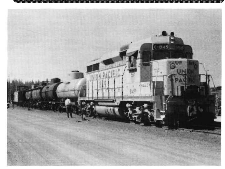
Railfan Day Train #3 with GP 30 UP 849 and tank car train has just made a photo run-by.