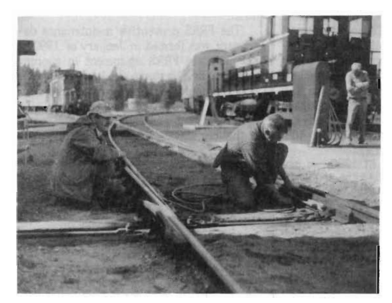
Ron Mathew from R.G. Mathew, Inc. in Grass Valley is shown installing an ice melting device on our terminal switch to test it.