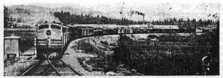
One of Western Pacific's freight trains passes the Delleker Lumber Company mill at the head of the Feather River Canyon with a trainload of miscellaneous westbound cargo.

westbound between Salt Lake City and Oakland, usually about twice weekly and is another preferred train covering the mileage in less than 48 hours. Its name is derived from Rule 10 in the Consolidated Freight Classification, which allows the mixing of various commodities for shipment under one rate.