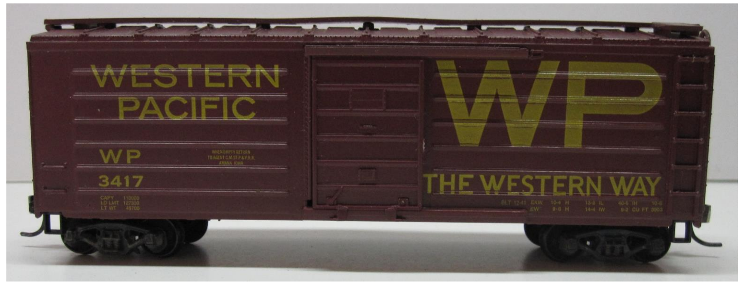
MDC Roundhouse # 1025 boxcar.

One of the more interesting 40 foot boxcar that the Western Pacific had in their freight car fleet, is a 40 foot Milwaukee Road ribbed side car. WP purchased two of these cars in 1962 when they needed to fill a specific shipper (appliance service pool) and instead of purchasing them new, WP found two cars from the Milwaukee Road. The two cars were built for the Milwaukee at their West Milwaukee Wisconsin shops in 1948-49.