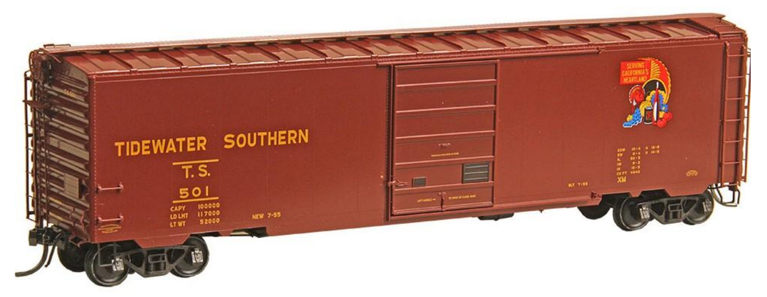
Kadee 6406, Tidewater Southern # 501 50 foot 8 ft 6 Panel Superior Doors, Built 1955, Boxcar Red Two of the Kadee TS cars, # 501 and # 509 were produced for the 2019 Joint PCR/FRRS convention in Sacramento (both now our of production).

Boxcars from the late 1930's and early 1940's to the 1980's are manufactured by several model companies. Here I list just a few, you may wish to perform an internet search and you will find several results for these cars.