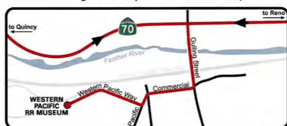
Western Pacific Railroad Museum

Caboose train rides are available weekends only from Memorial Day through Labor Day weekends. Ride fares are $4 for adults, $2 for children 4-18 and $10 for families. Cab rides are $20 for adults and $10 for children. Train ride tickets are good all day, cab rides for one trip.