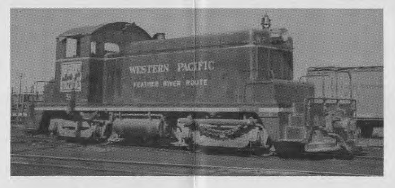
Preserved in Portola is the WP 501 and EMD SW-1 built in 1939 which was the first diesel on the Western Pacific.

The FEATHER RIVER RAIL SOCIETY, a tax exempt California Corporation, operates the PORTOLA RAILROAD MUSEUM at Portola, California. Formed in February, 1983, to establish a railroad museum in Portola with the purpose of preserving local railroad history in general and Western Pacific Railroad history in particular. As a Society we are involved with restoration and collection of railroad equipment, photos, artifacts, historical information and data.