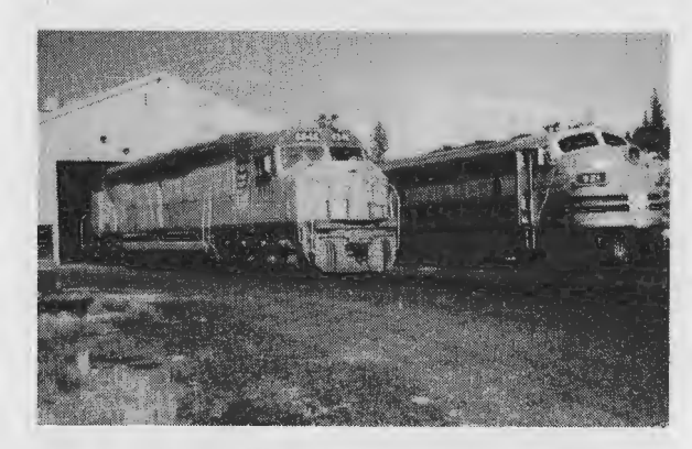
UPDDA-40X, 6946, WPF-7A, 921 along with the last Zephyr locomotive WP 805-A are at the museum site.

With over 20 diesels the Society has one of the largest collections of preserved diesels and over 50 pieces of freight equipment and every style of WP caboose from wood to steel. All undergoing restoration to correct paint schemes.