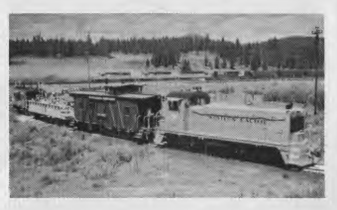
"Come ride In a caboose"

We have leased the former Western Pacific diesel shop building and adjacent track area in Portola from the Union Pacific through the City of Portola for our museum site. The 37 acres included in the lease has about 12,000 feet of track including a balloon track for turning equipment and a 16,000 sq. ft. shop building with two tracks running the 220 foot length. A repair and restoration shop facility, library, office and meeting rooms will be included within the structure. Other property improvements include a replica W.P. passenger depot, freight depot for a future model railroad layout, section house, water tank and a picnic and park area.