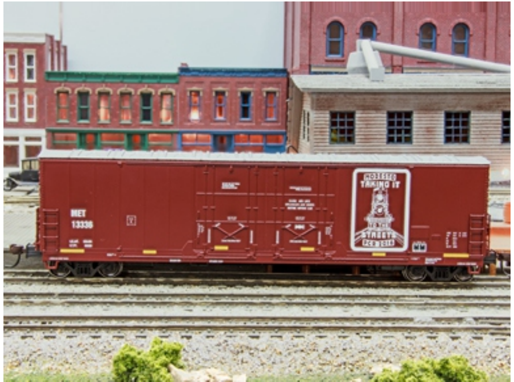
Convention Car for Modesto Convention Modesto Empire Traction 53-foot Evans Double Door Box Car

PCR Convention "Taking it to the Streets of Modesto 2016" Arrives in Modesto April 20-24, 2016