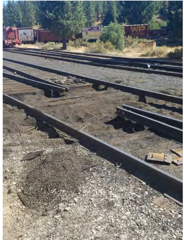
In progress...