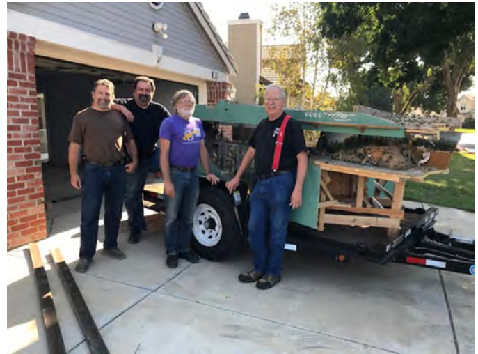
Here's the moving crew, smiling now that the layout sections are on the trailer.