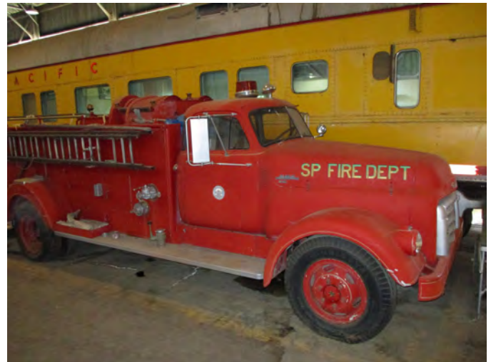
SP 1 at Portola