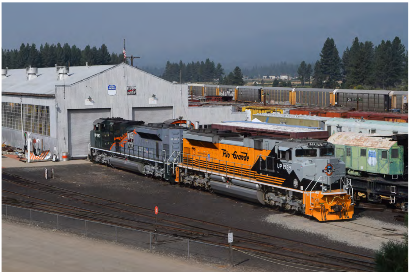
Union Pacific sent two heritage units to Portola's 2018 RR Days celebration. UP 1989 & UP 1983 are seen here on east 2 rail. There are more photographs from RR Days on the website on the WPRM Photo & Video Gallery web page.

Look for the latest 2019 FRRS Calendar in the Latest Museum News column on the website home page, www.WPLives.org