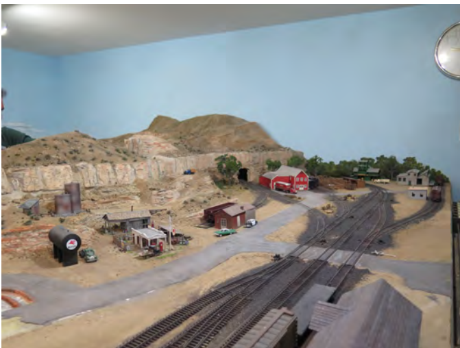
Need Gas?