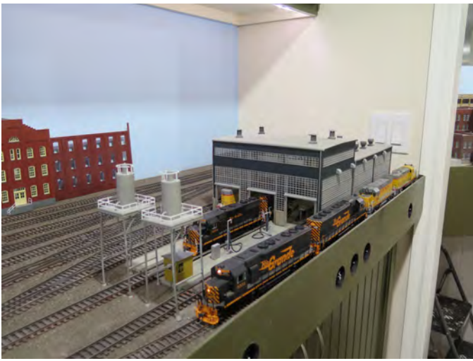
Rio Grande Engine Shop