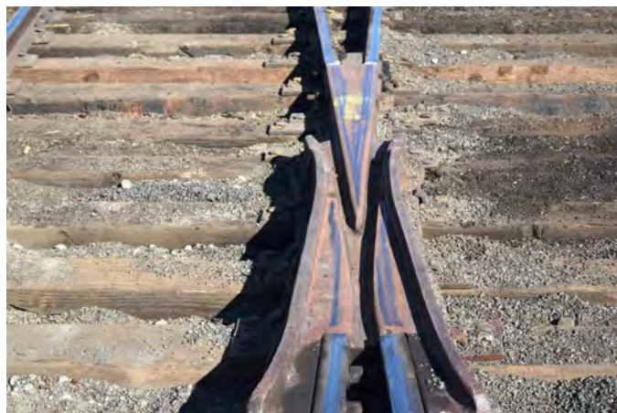
New Frog