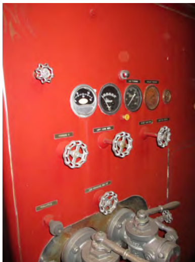
Controls and under the hood of the fire truck