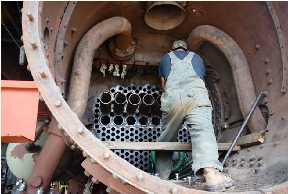
Channing Walker helping Roger Stabler with the super heater flues from the smoke box end of the 165.