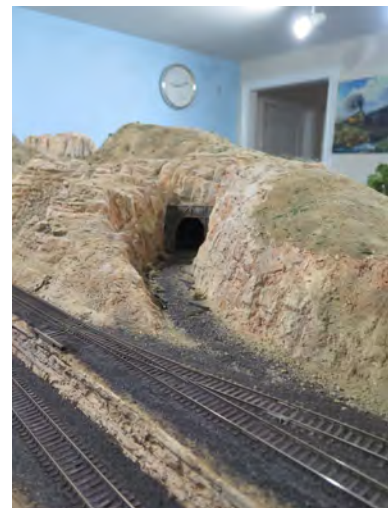
Abandoned Right of Way and Tunnel