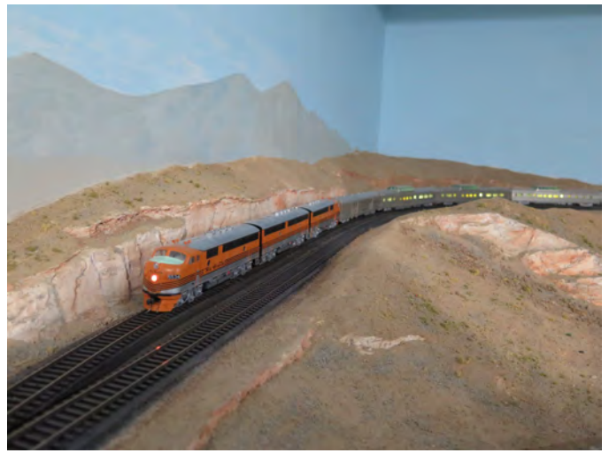
D&RGW California Zephyr - photo by Kerry Cochran