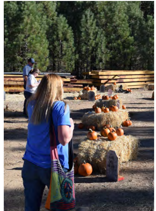
...from around the 2018 WPRM Pumpkin Patch (more photos on website in 2018 Pumpkin Trains gallery)