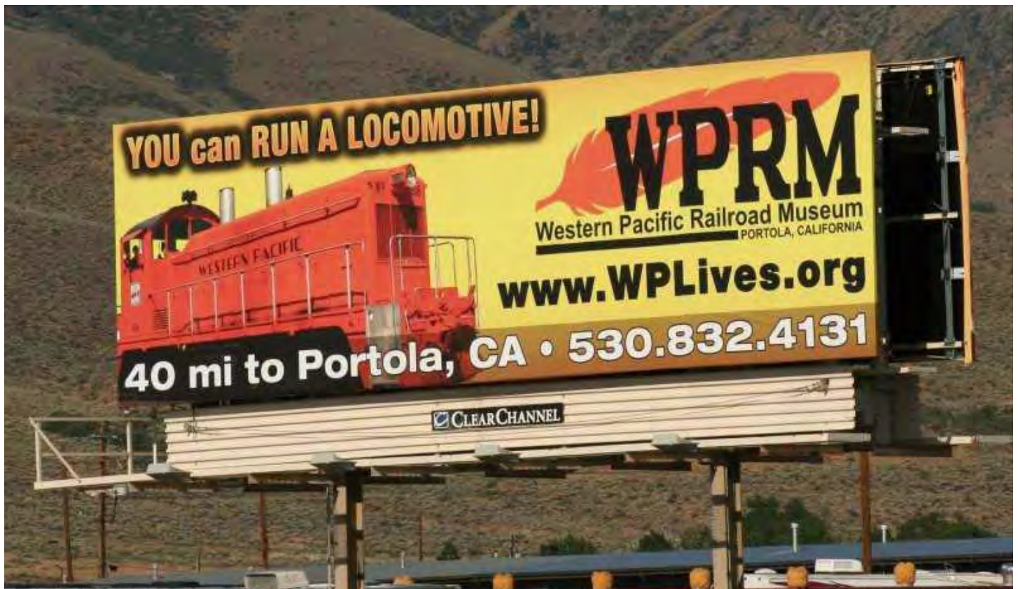
The WPRM billboard greets travelers on US highway 395 in 2009.