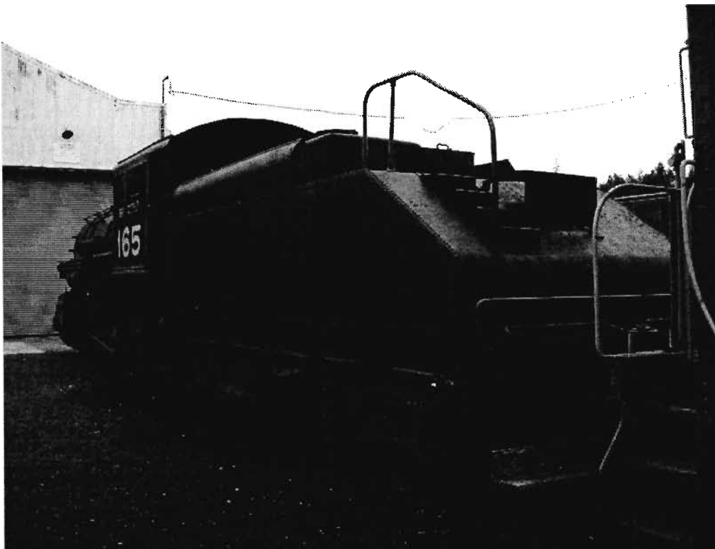
Western Pacific 165 has arrived at the museum.