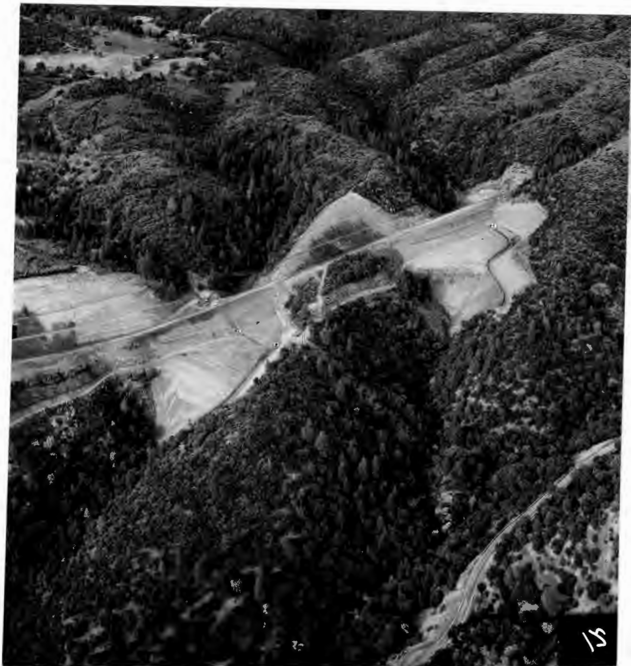
No. 853-12 11-28-60 Tunnels Nos. 2 and 3 (W.P.R.R. Tunnels Nos. 5 and 6). Aerial view of waste area right of Station 1065- and Station 1076 + . Grizzly Creek is passed through twin 126-inch culvert at right center.