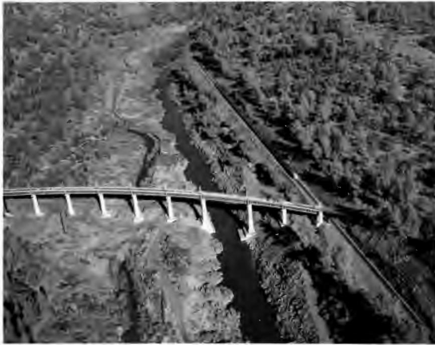
No. 559-1 1-15-60 Feather River Bridge looking upstream. Temporary crossing over existing W.P.R.R. tracks at far right.