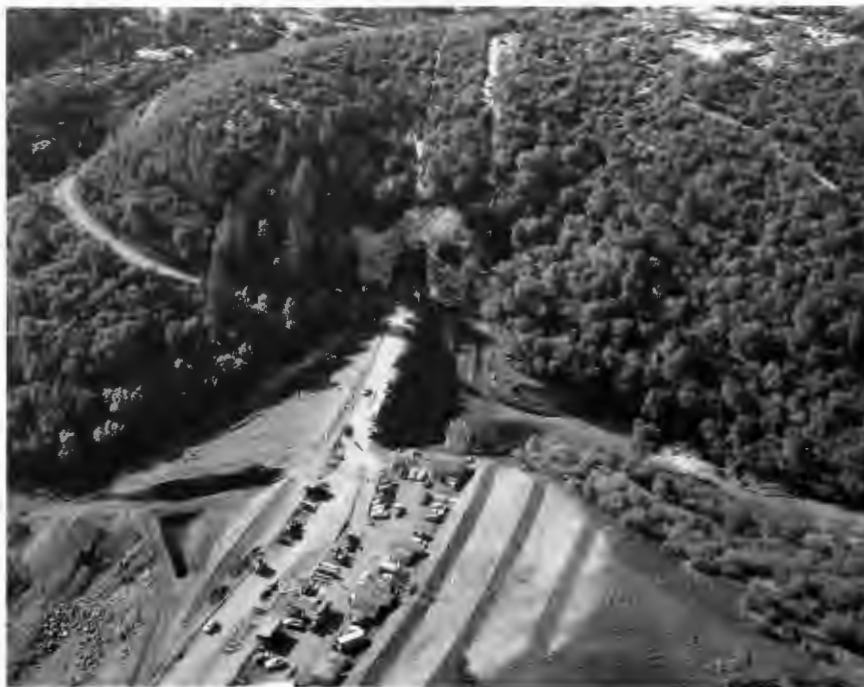
No. 562-4 1-15-60 Tunnels Nos. 2 and 3 (W.P.R.R. Nos. 5 and 6). Portal 2E interceptor ditch over Portal. Cut slopes and fill over 138-inch CIMP and 150-inch CIMP. Inlet to 138-inch CIMP at Station 1002+08.