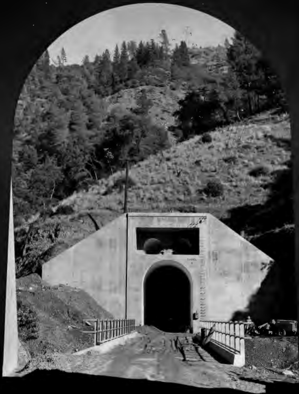
No. 857-2 12-5-60, Tunnels Nos. 4 and 5 (W.R.R.R. Nos. 7 and 8). Portal 5W from inside Tunnel No. 4. Ventilation chamber ready for fans. Dark Canyon Bridge completed.