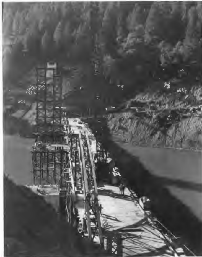
No. 239-1 12-15-58 North Fork Bridge. View back on line shows center support tower partially assembled half main false work section.