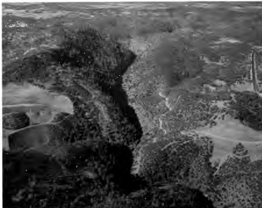
No. 542-1 11-25-59 West Branch Bridge. Aerial view of bridge site looking west.