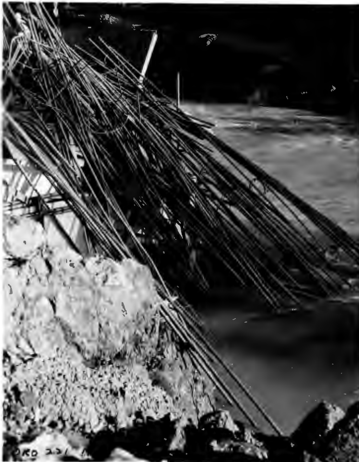
No. 221 1-13-59 Feather River Bridge Pier No. 4. Close-up of No. 18 bar steel lying in river.