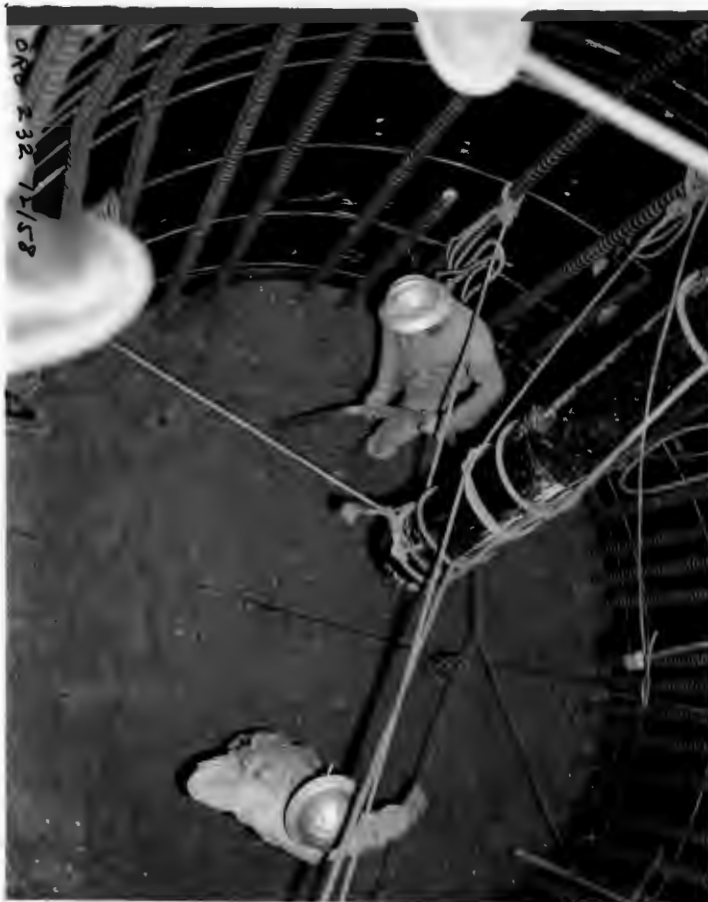
No. 232 12-19-58 Feather River Bridge. Vibrating concrete in Pier No. 6.