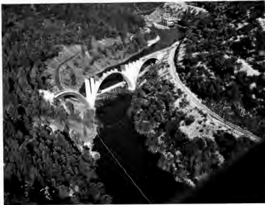
No. 560-5 1-15-60 North Fork Bridge. Aerial view of bridge showing access road on right bank of Feather River.