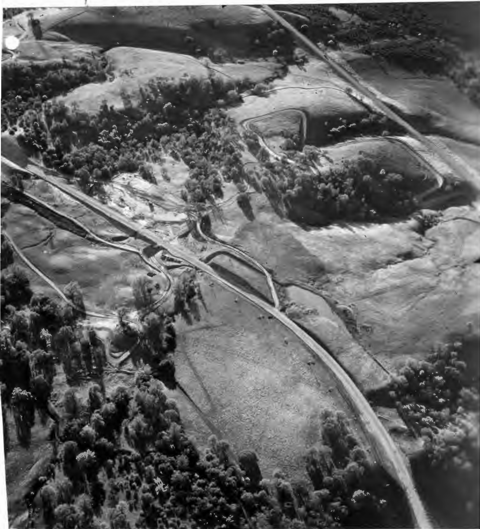
No. 1174-53 12-8-61 Oro Pentz Grading. Aerial view of Wheellock's reservoir and access road to Wheellock pit.