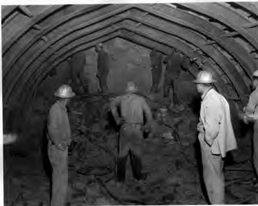
No. 188-5 10-25-58 Tunnel No. 4 (W.P.R.R. No. 7). Placing final lagging prior to holing out of Portal 4W.