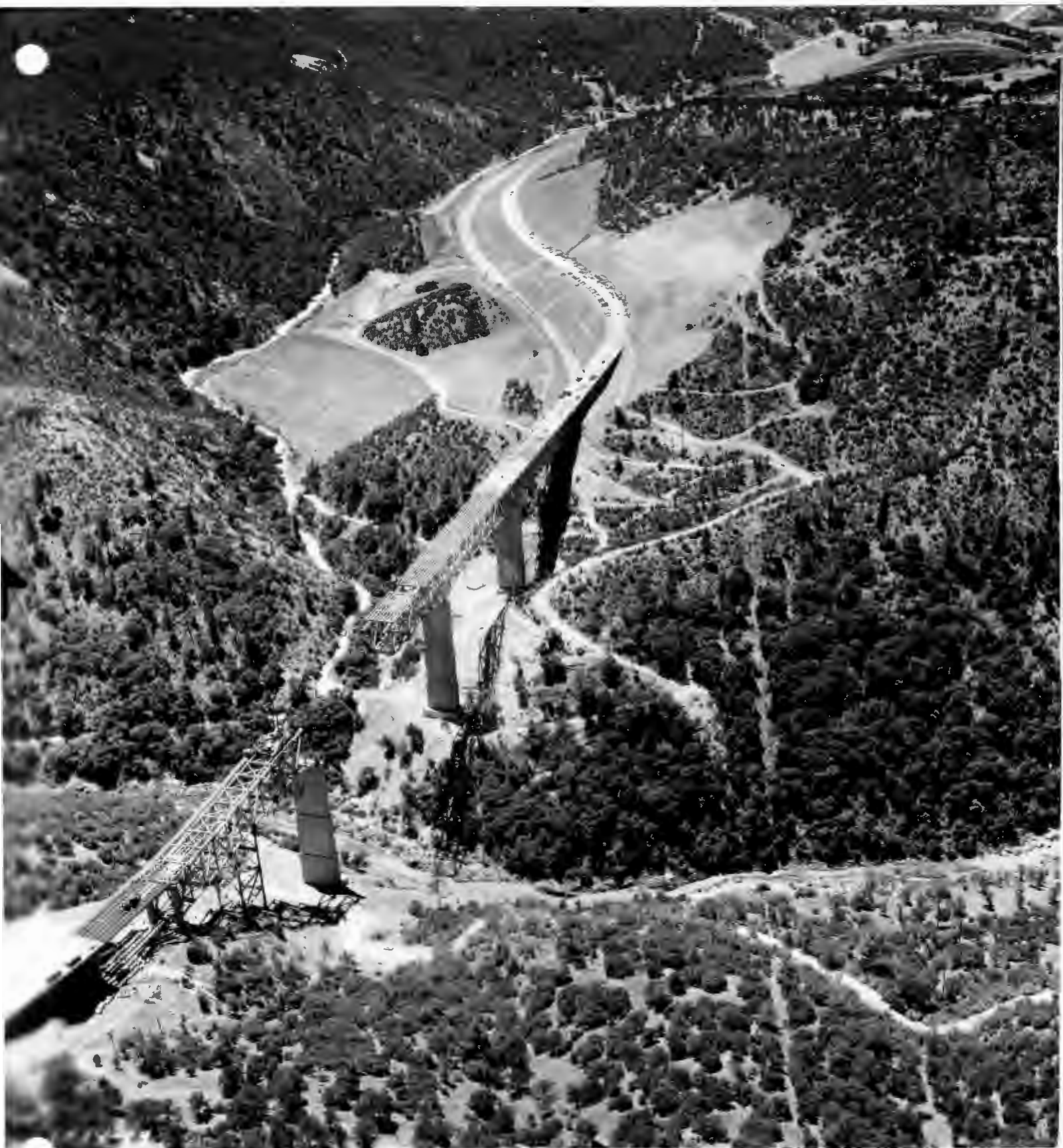
No. 1034-19 7-6-61 Aerial view of West Branch Bridge.