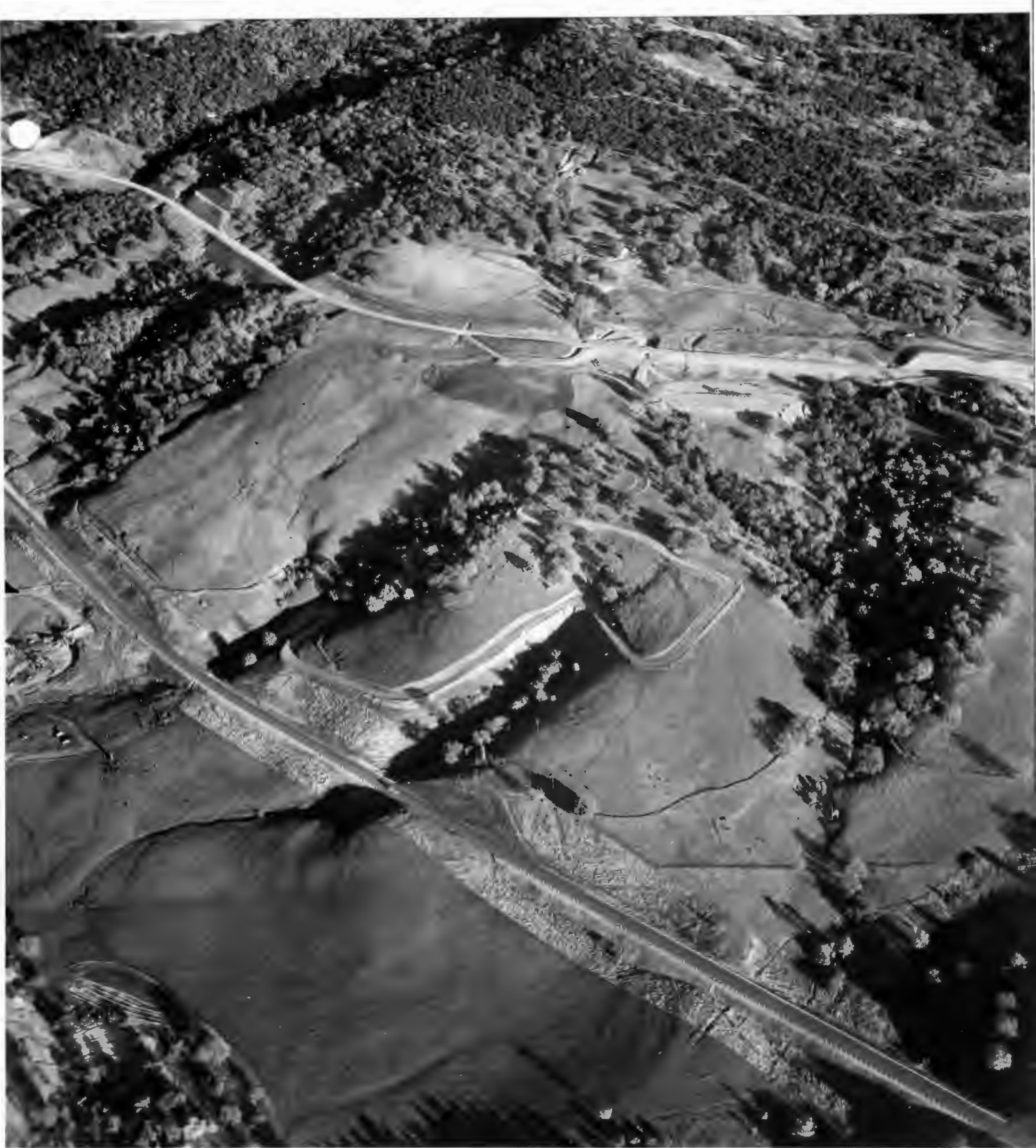
No. 1174-50 12-8-61 Ore Pentz Grading. Aerial view showing road from Wheelock pit to roadbed.