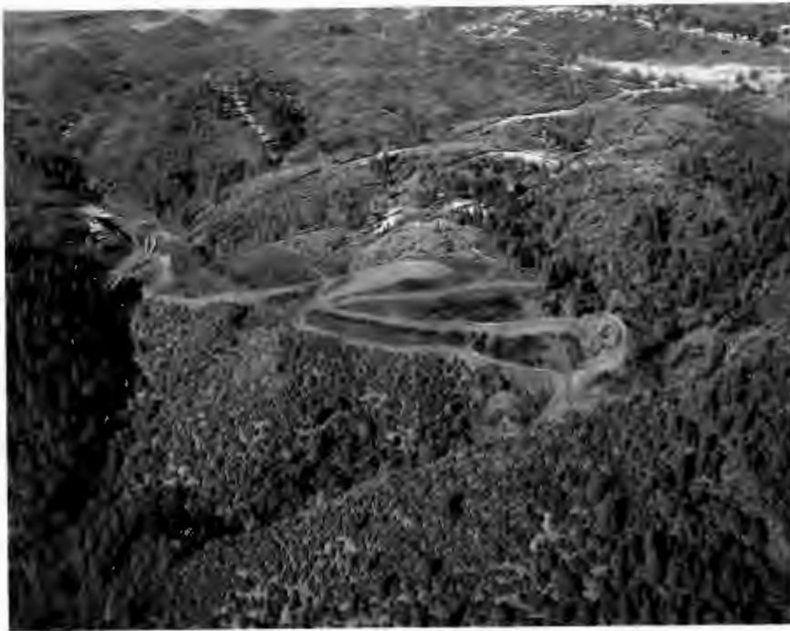
No. 561-1 1-15-60 Tunnels Nos. 2 and 3 (W.P.R.R. Nos. 5 and 6). Grading, clearing and excavation for Portal 3E.