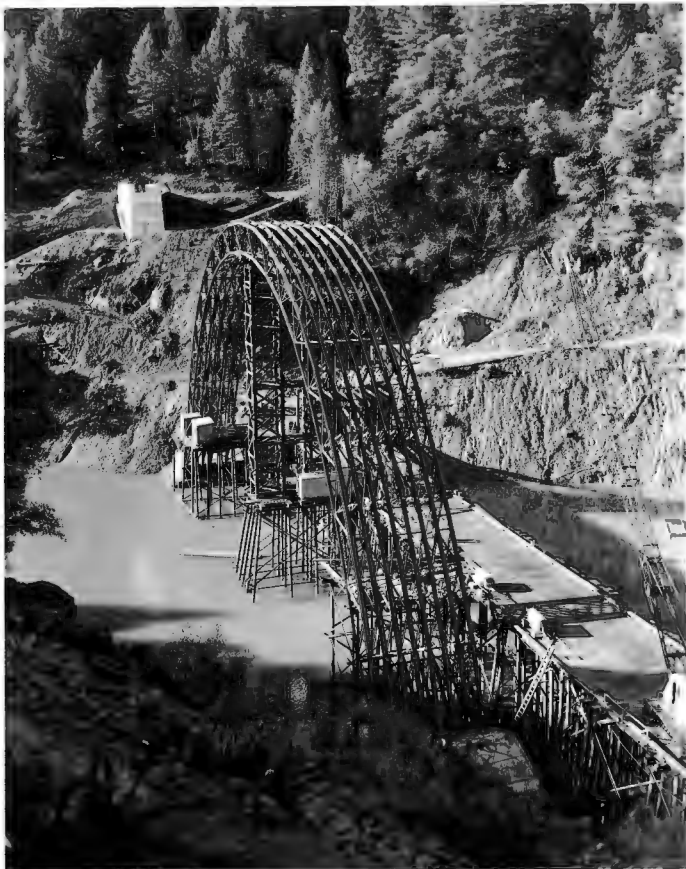
No. 259-4 1-30-59 North Fork Bridge. Looking back on line at main falsework arch between Piers Nos. 2 and 3, Pier No. 1 at upper left.