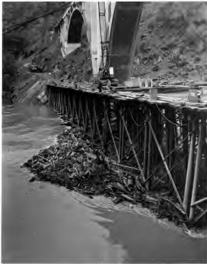
No. 582-1 2-9-60 North Fork Bridge. Debris piling up at the work trestle during high water.