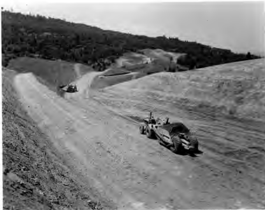
No. 1000-2 5-19-62. Oro Pentz Grading Job.