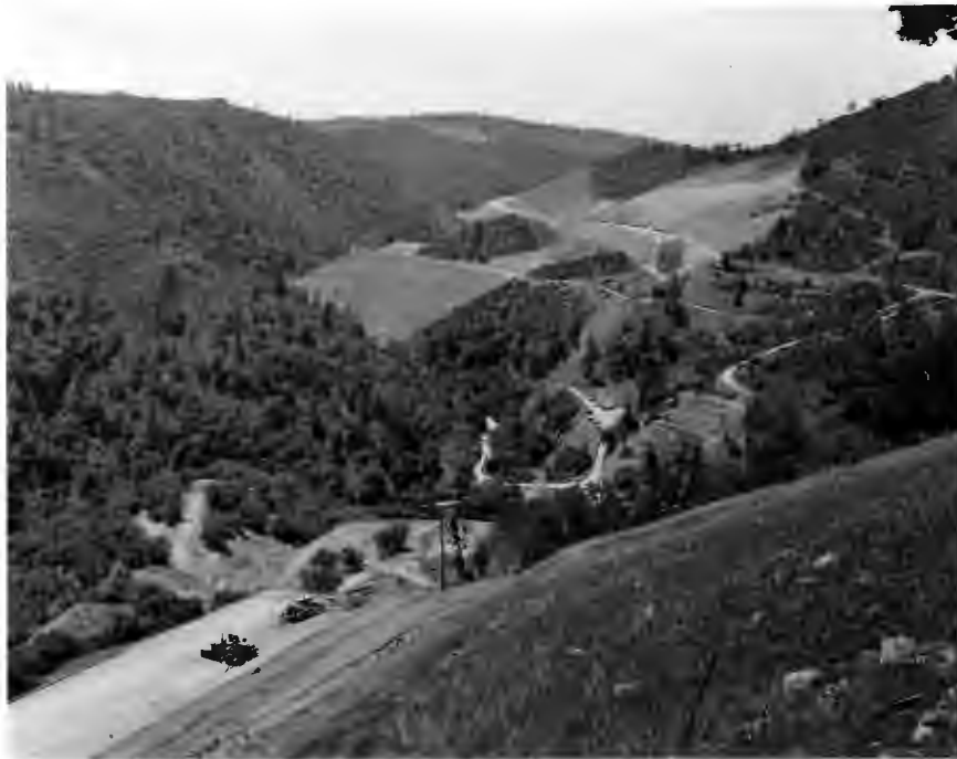
No. 690-8 5-10-60. West Branch Bridge. General view of bridge site, east abutment lower left at bulldozer - access road to intermediate piers, west abutment and piers near completion at top center.