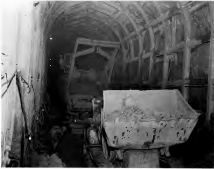
No. 154-1 8-18-58 Tunnels Nos. 4 and 5 (N.P.R.R. Nos. 7 and 8). Loading muck train after blasting. Note rock being moved to forward part of train.