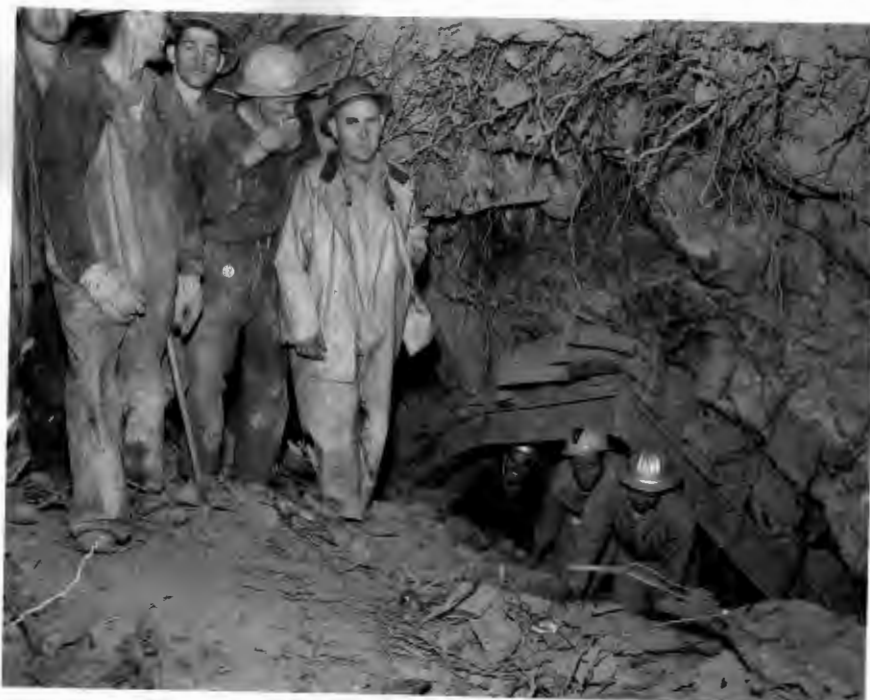
No. 188-3 10-25-58 Tunnel No. 4 (W.P.R.R. No. 7). Hole through at Portal 4 West, 1:44 a.m., October 25, 1958. Ten months elapsed time.