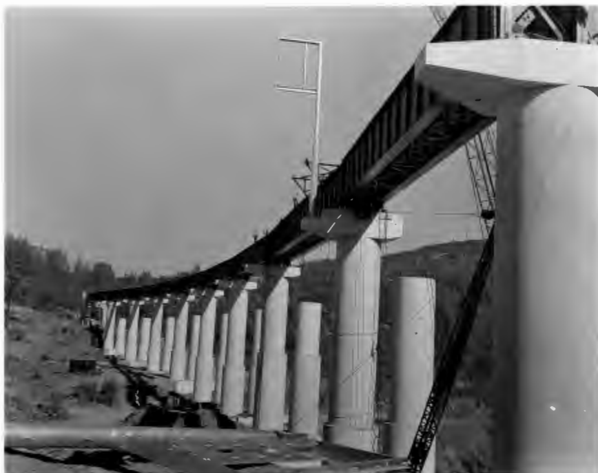
No. 426-7 7-27-59 Feather River Bridge. View of underside of in-place girders during erection.