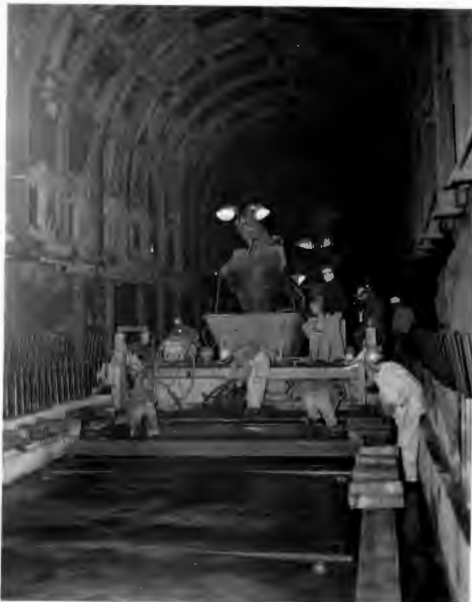
No. 894-5 2-3-61 Tunnels Nos. 2 and 3 (W.P.R.R. 5 & 6) Tunnel No. 2. Invert paving train consisting of mixer, conveyor, hopper, spreader and vibrating screed operating in Tunnel No. 2. Note joint spacers and weep hole plugs.