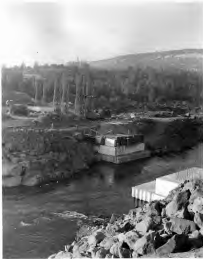
No. 235-2 12-14-58 Feather River Bridge. Overall view looking ahead on line. Steel workers making final ties on reinforcing steel, Pier No. 6.