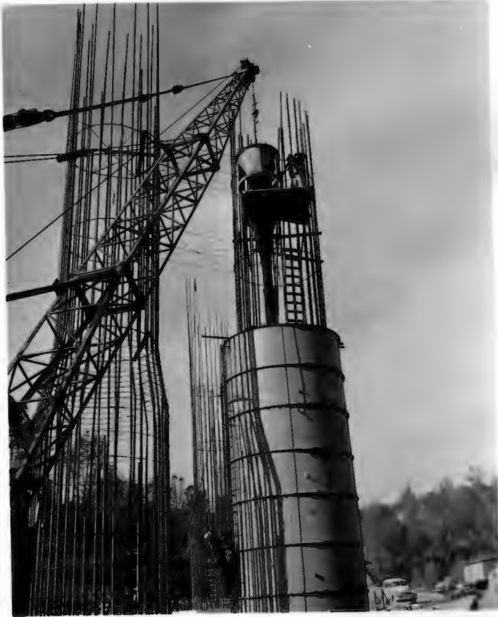
No. 227 12-19-58 Feather River Bridge. Close-up of concrete placing operation at Pier No. 6, using platform and tremie tube.