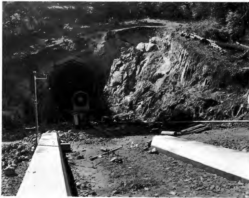
No. 490-1 9-21-59 Tunnels Nos. 4 and 5 (W.P.R.R. Nos. 7 and 8). East Portal Tunnel No. 5, Abutment No. 1, North Fork Bridge.