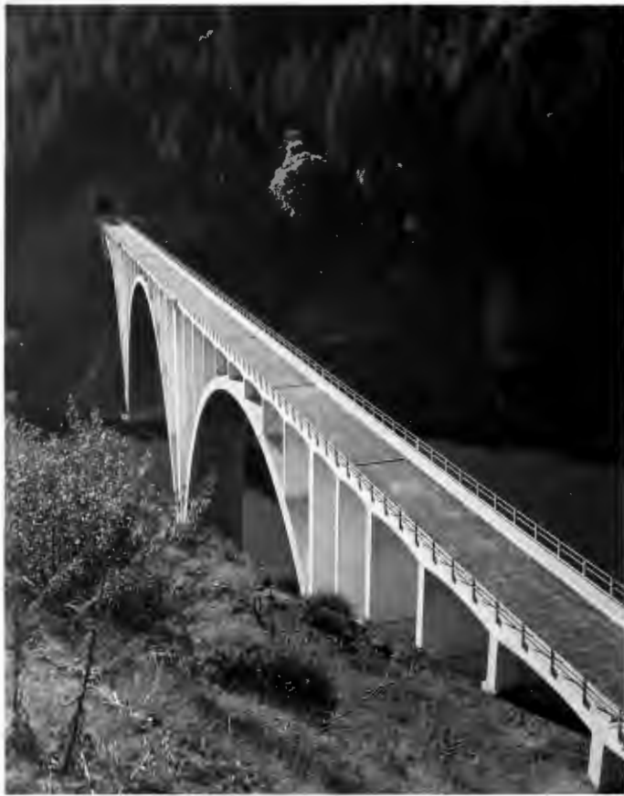
No. 859-2 12-5-60 North Fork Bridge looking toward Tunnel No. 5. East Portal Bridge is completed and ready for ballast and rails by Western Pacific.