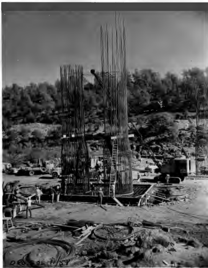
No. 202 11-7-58 Feather River Bridge. View showing men and equipment at work placing concrete on Pier No. 8.