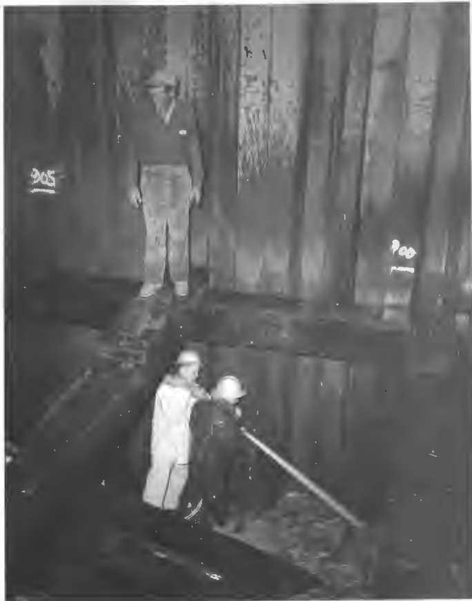
No. 191-1 10-16-58 North Fork Bridge. Washing down bedrock before placing reinforcing steel at Pier No. 3.