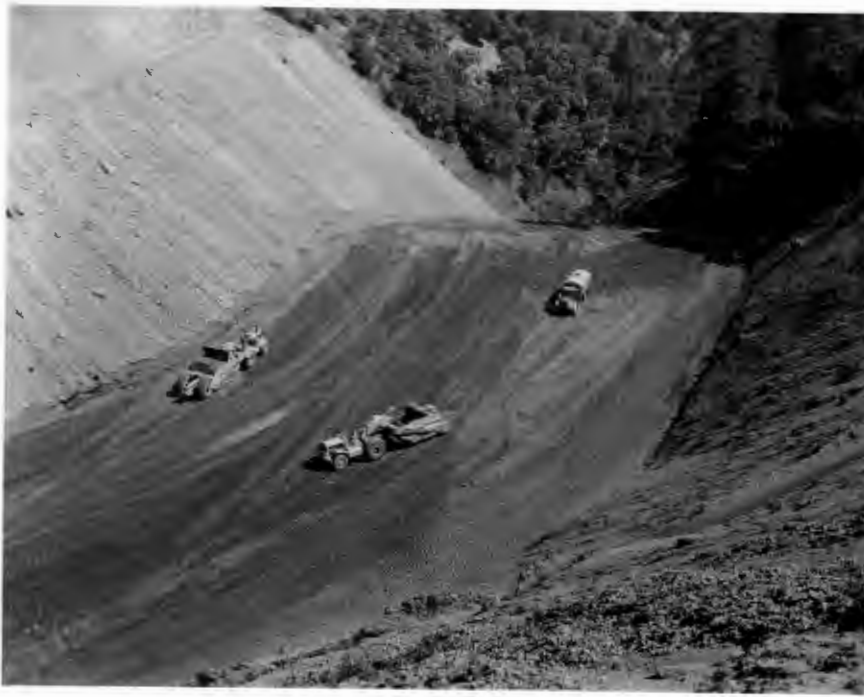
No. 694-6. Tunnels Nos. 2 and 3 (W.P.R.R. Tunnels Nos. 5 and 6). Placing fill in Grizzly Creek Canyon near west portal Tunnel No. 4.