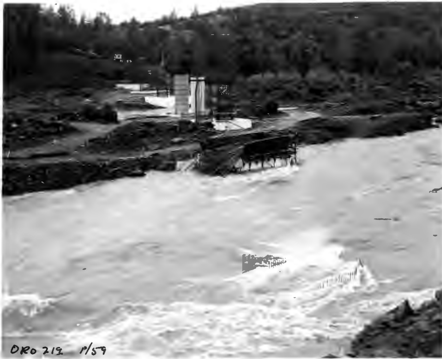
No. 219 1-12-59 Feather River Bridge. Looking ahead on line. Note reinforcing steel of Pier No. 3 in foreground. Collapsed reinforcing steel on Pier No. 4 across river.