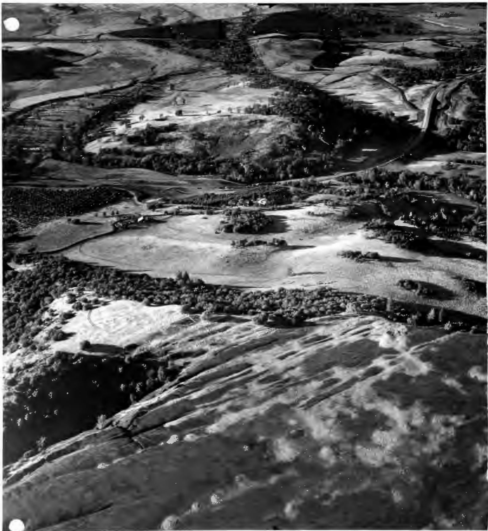
No. 1174-49 12-8-61 Oro Pentz Grading - Dodge Slide Area.