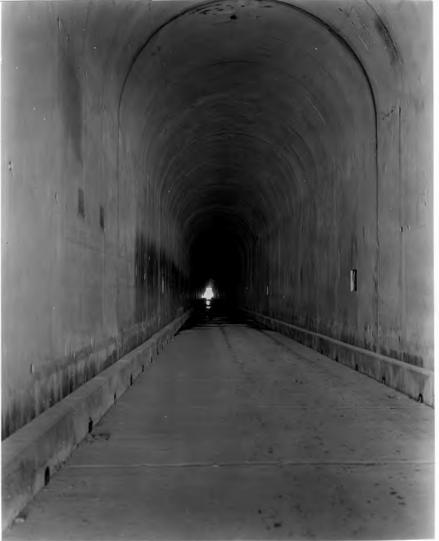
No. 857-1 12-5-60. Tunnels Nos. 4 and 5 (W.P.R.R. Nos. 7 and 8). Completed section of Tunnel No. 4. Portions of the invert are subject to standing water.