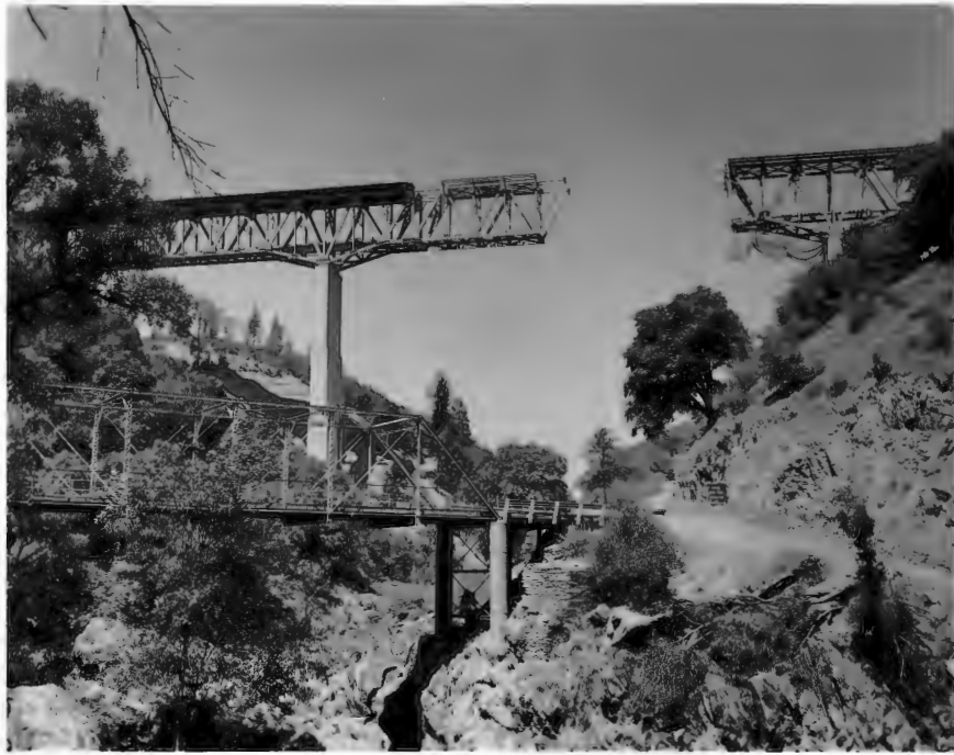
No. 1075-1 9-1-61 West Branch Bridge under construction. Old County Road Bridge in foreground.