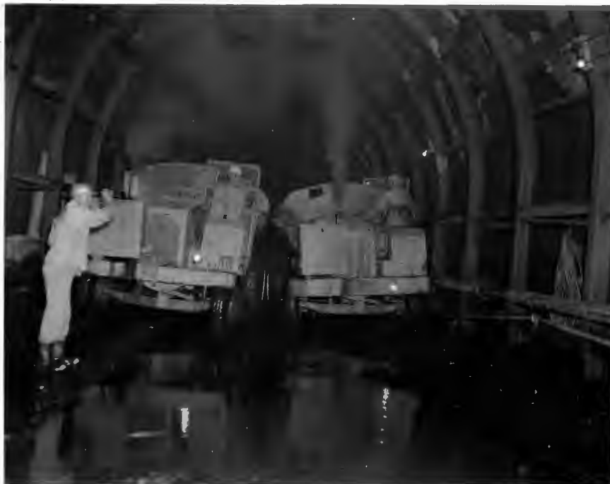
No. 694-18. Tunnels Nos. 2 and 3 (W.P.R.R. Tunnels Nos. 5 and 6). Dumpsters passing in tunnel top heading excavation.