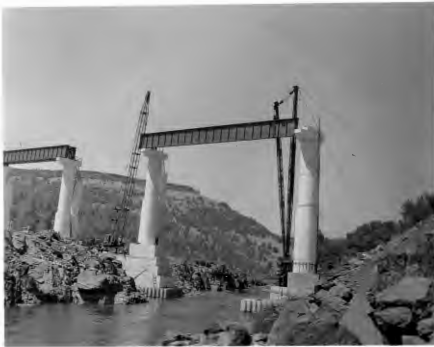
No. 421-3, Feather River Bridge. View of girder being positioned on pier caps.