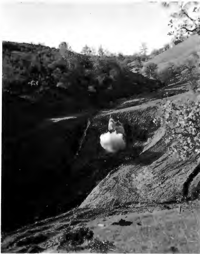
No. 938-8 Tunnel No. 1 (W.P.R.R. No. 4). Hole Through Portal 1 E