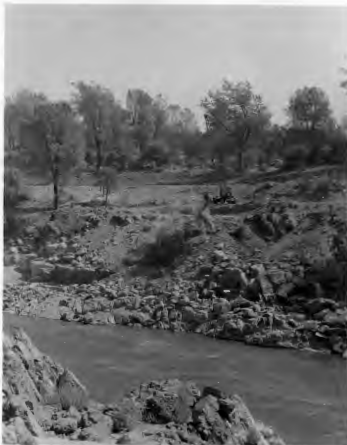
No. 157-3 9-8-58 Feather River Bridge excavation proceeding at Pier No. 2. Existing N.P.R.R. track in back- ground.