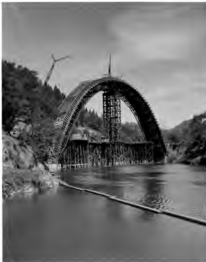
No. 311-2 North Fork Bridge, looking upstream at main falsework arch between Piers Nos. 2 and 3.