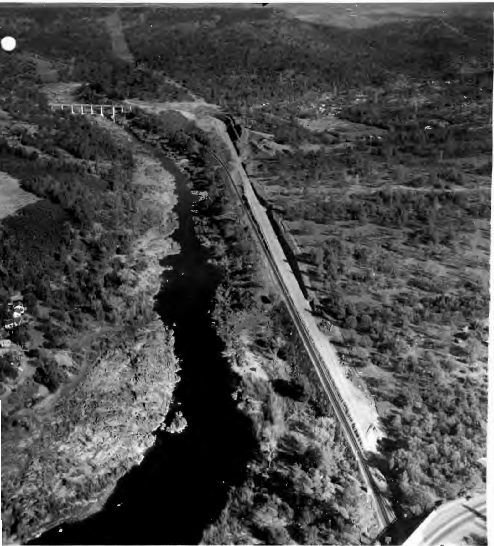
No. 1185-14 1-16-62 Oro Pentz Grading. Aerial view at east Oroville. Note subbase material in piles to be used when track is removed.