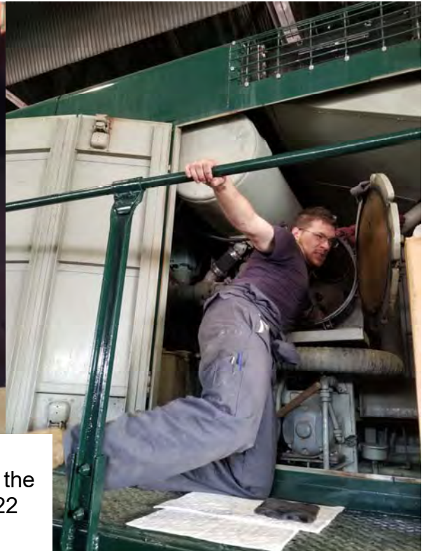
A look around the museum 2022