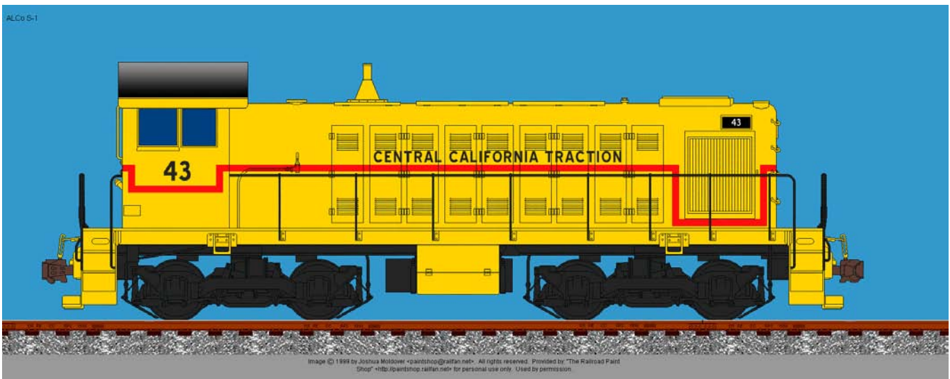
Central California Traction Company chrome yellow