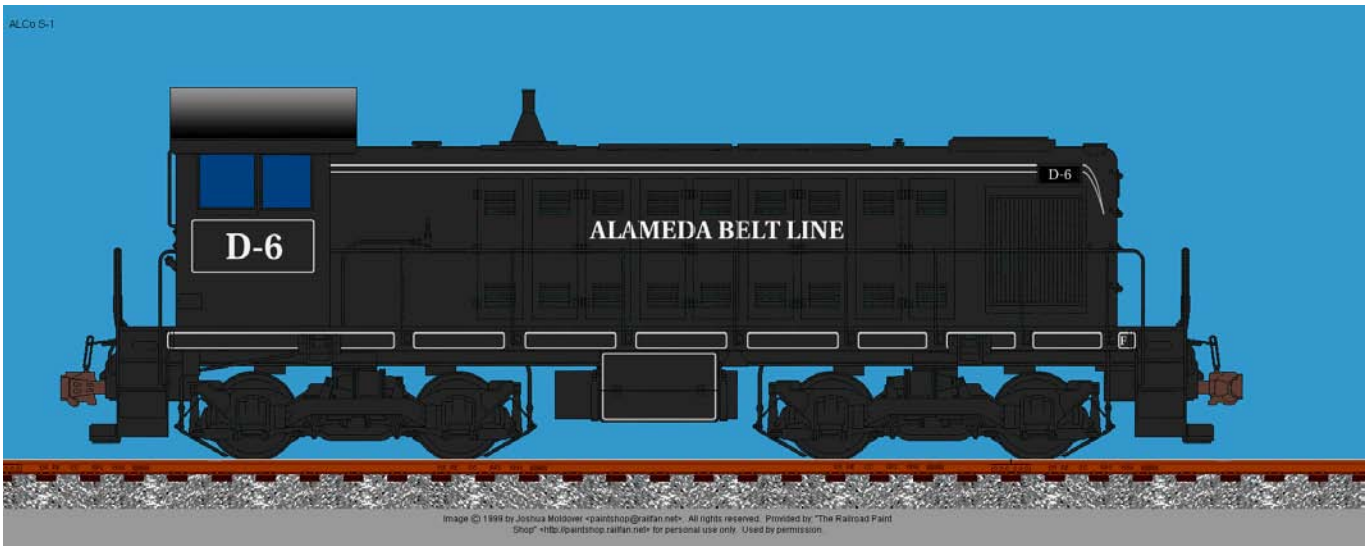
Alameda Belt Line delivery scheme - black with pinstripes

We present the following five paint schemes for consideration by the Board: