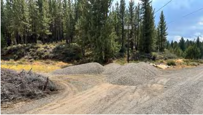
90 Yards of Rock for Work on the Balloon Track

I had to leave the museum for a couple of weeks for family issues I needed to tend to. I returned on Friday the 26 th of August to start prepping for the following week. We had several items on the steam engine that needed attention to be operational for the Labor Day weekend. I did put in one additional tie between the two-switch frog and three switch and tightened up a few ties near the number two switch so the track could be placed back in service for the weekend.