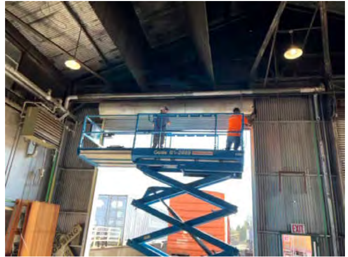
New roll up doors on east end of shop being installed on August 5, 2022.

In addition to the locomotives and the shop, a lot of attention has been paid to a variety of equipment with a huge shout out to Roger Stabler. Other than some tweaking to the bend of couple of blades and the issue with the hydraulic pump at certain RPM's, the ballast tamper has been gone through and seems to be working quite well. Roger and I worked on ballast car WPMW 10760, which now has a serviced handbrake, a fourth (and final) operable door and a repaired trainline. The many leaks on the backhoe, both new and old, have been mostly repaired; there are some hydraulic lines that will come due sooner than later and the issue with the seal between the gearbox and torque tube that remains.