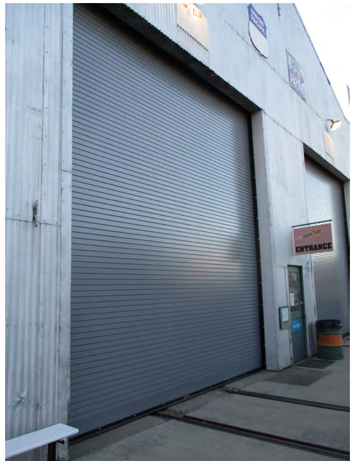
New Roll Up Doors on East End of Shop After many years of being out of service, the doors on the east end of the shop were replaced August 1-4, 2022.