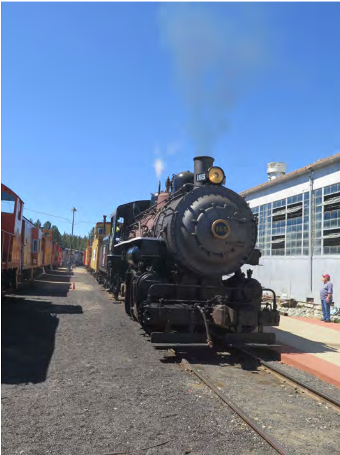
W 165 on three rail with the museum's demonstration caboose train on July 3 rd , 2022.

I hope everyone has a great fall and I look forward to seeing many of you at the museum in October. Till next time, full steam ahead.