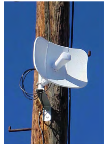
New antenna for internet service

services, which will save the museum several hundred dollars in monthly billings with the lower cost of the new PST service. In addition to the Plumas-Sierra Telecommunications service being lower cost, it is also significantly better than the AT&T Internet service on every performance metric.