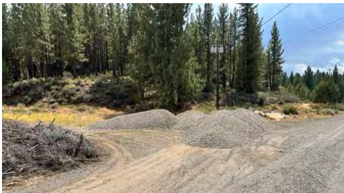
90 yards of new ballast for balloon track.

You can find more information about our LOED in The Train Sheet issue 184 - January/February/March 2020.