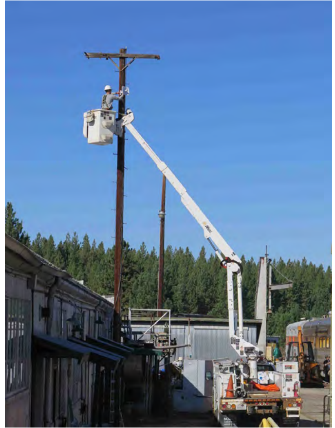
PST Employee Austin installing the antenna for the new system.

The signal department cut the museum network over to the new service and performed extensive testing to ensure that the new service was acceptable for the museum. The point-of-sale