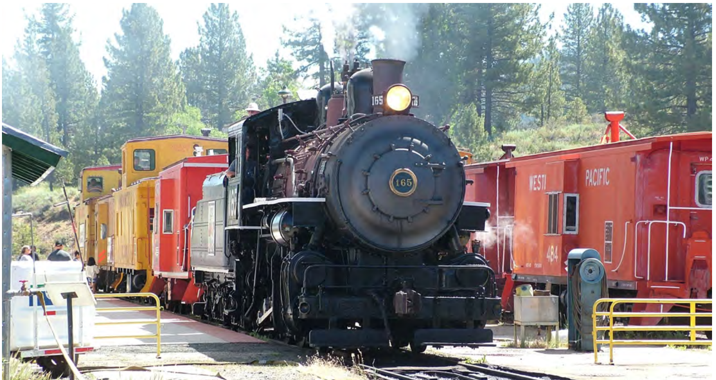
Live Steam at the WPRM July 2 nd , 2022!

Sunday the 3 rd was a warm day at the museum. We took turns relieving each other on the engine due to the heat. The boiler operates at about 390 degrees and is about two feet from the