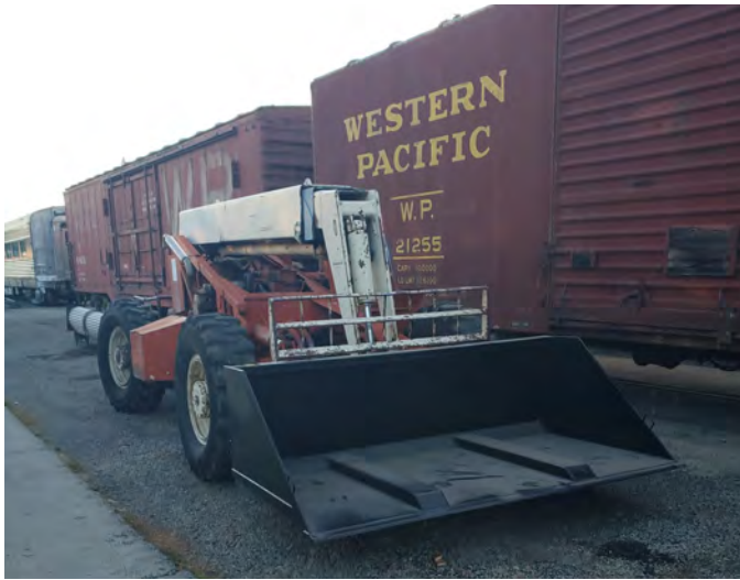
New bucket for the museum's LOED.