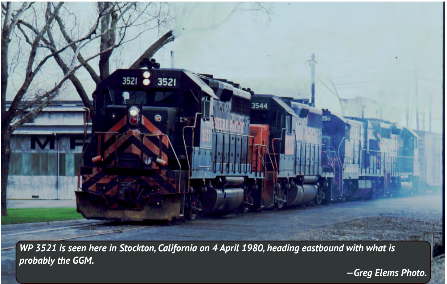
WP 3521 is seen here in Stockton, California on 4 April 1980, heading eastbound with what is probably the GGM.