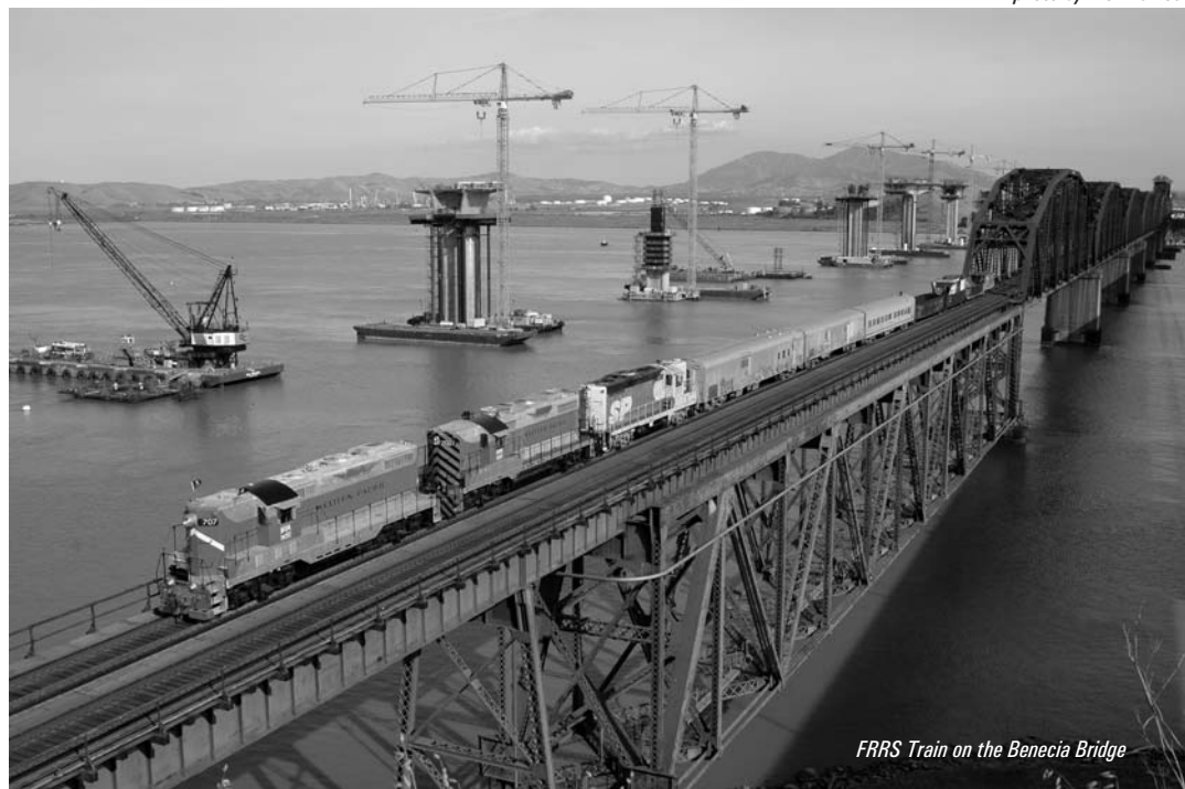
FRRS Train on the Benecia Bridge