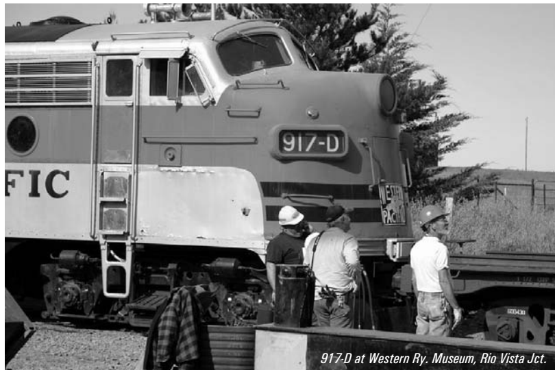
917-D at Western Ry. Museum, Rio Vista Jct.