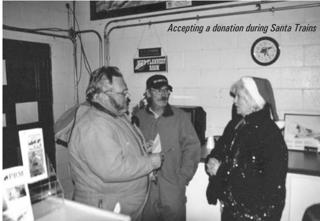
Accepting a donation during Santa Trains