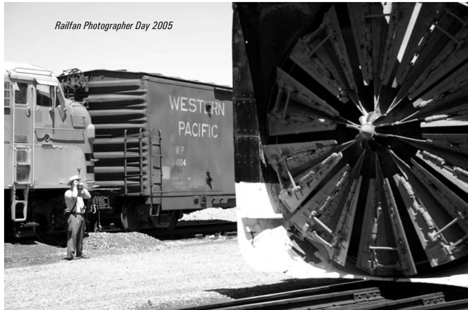
Railfan Photographer Day 2005