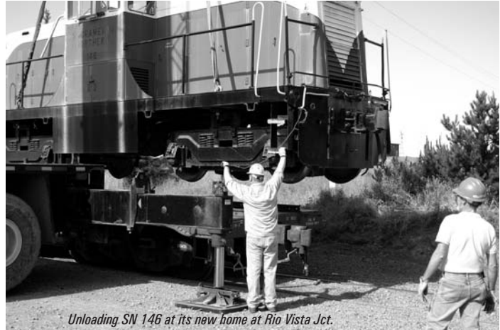
Unloading SN 146 at its new home at Rio Vista Jct.