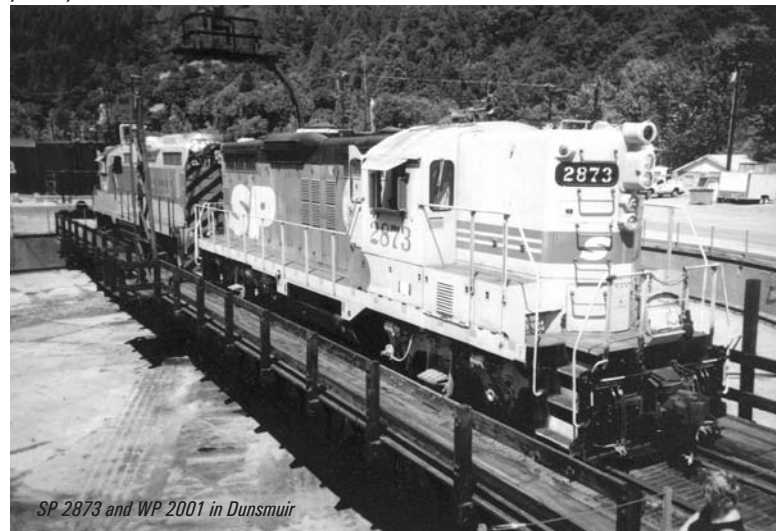
SP 2873 and WP 2001 in Dunsmuir