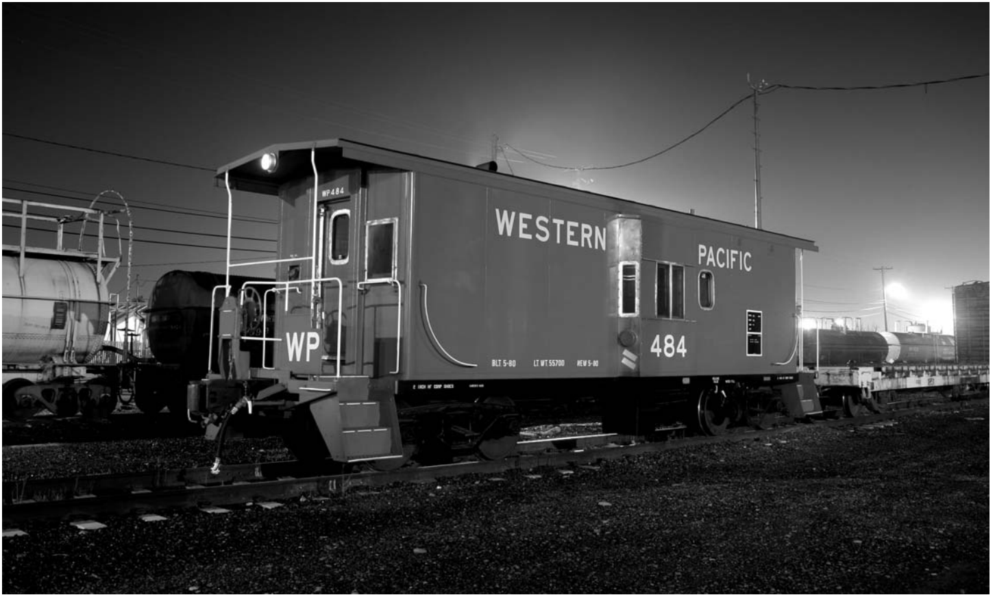
WP 484 sparkles under nighttime lights