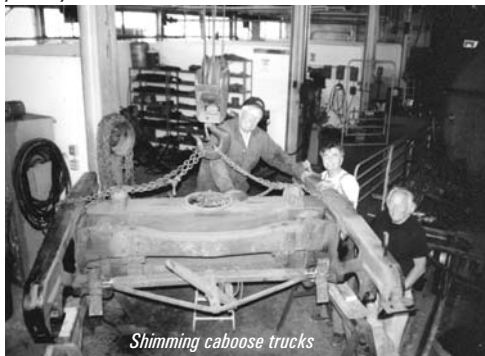
Shimming caboose trucks