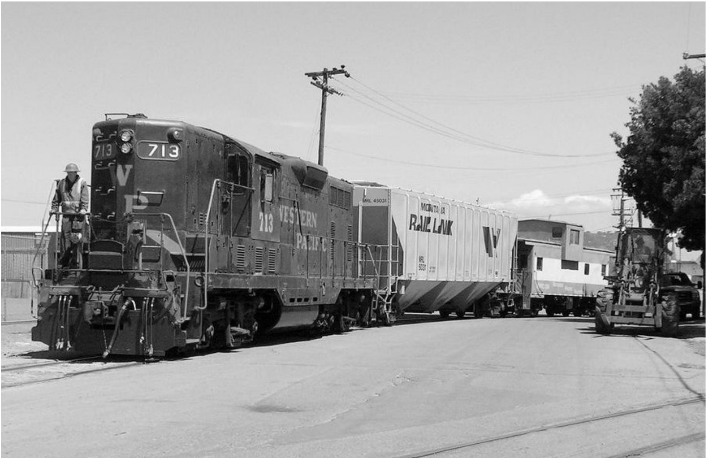
WP 713 works on the Richmond Pacific crossing Wright Street in Richmond CA.