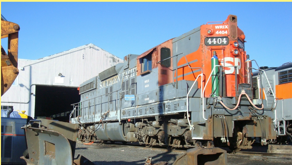
WRIX 4404 (Formerly SP 4404), still in SP's "Bloody Nose" paint, receives facial reconstruction surgery. The locomotive is seen here getting new alignment-control couplers for the move to Western Rail's shops.