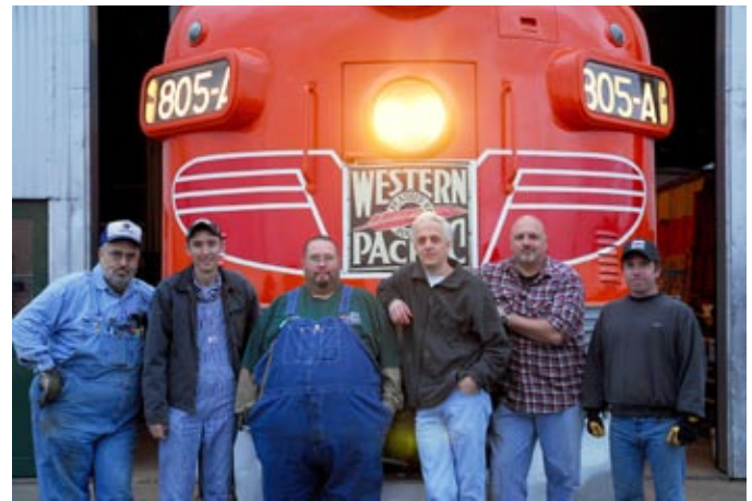
The Wash 'n Wax crew.