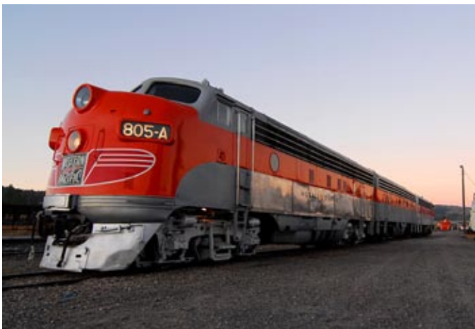
WP Zephyr engine 805-A awaits the Mini-Zephyr.

behind the power set was WP NW2u 608 waiting to act as terminal switcher. With a coupling so soft no one eating even saw a ripple in their wine glasses, FRRS President Rod McClure tied the 608 on to the "Silver Solarium" and pulled the cars onto the museum grounds.