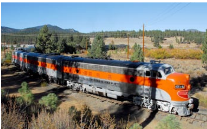
The Zephyr train on the balloon track.

On Saturday, October 31, the show got even better. With the exception of the "Silver Hostel", every CZ car on the property, plus guest car "Magnolia Grove" (SP sleeper of a type often seen on the Zephyr), were tied behind the F-units and given a run around the balloon track. WP 805-A led the dome-coaches "Silver Rifle", "Silver Lodge" and "Silver Lariat", diner "Silver Plate", sleepers "Silver Rapids" and "Magnolia Grove" with the dome-obs "Silver Solarium" rightfully bringing up the rear. It was an extremely proud moment for all our volunteers and members. This was likely the largest congregation of CZ cars in over 30 years.