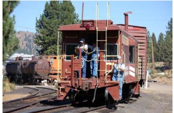
The crew provides protection for the back-up move from the platform of WP caboose 428.

925-C was the power and controlled by Charlie in the 805-A. The B crew in the WP GP7 707, WP GP20 2001 and a modern boxcar train followed out the 805-A. Next was the A crew in WP NW2u 608 and a local freight. The B crew followed that after a small power swap by Ops Supervisor Bill Parker in the USArmy H-12-44 1857. He along with yardmaster Habeck, took the 925-C and married it to the SN GP7 712.