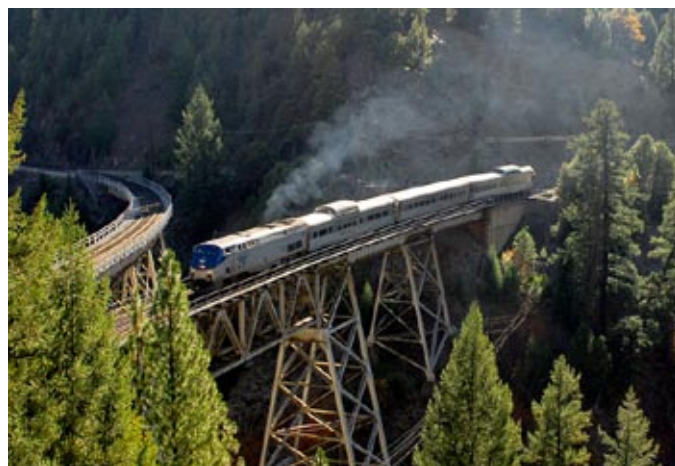
The train pauses on Keddie Wye.