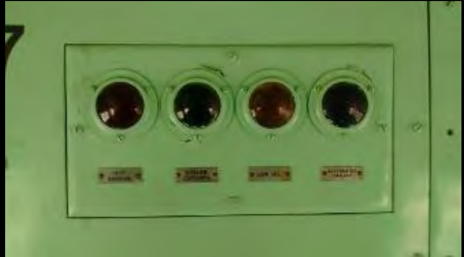
Hot Engine, Boiler Stopped, Low Oil, Alternator Failure