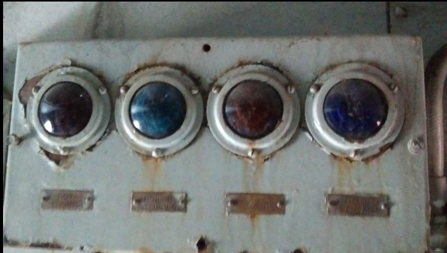
Hot Engine, Boiler Stopped, Low Oil, Alternator Failure